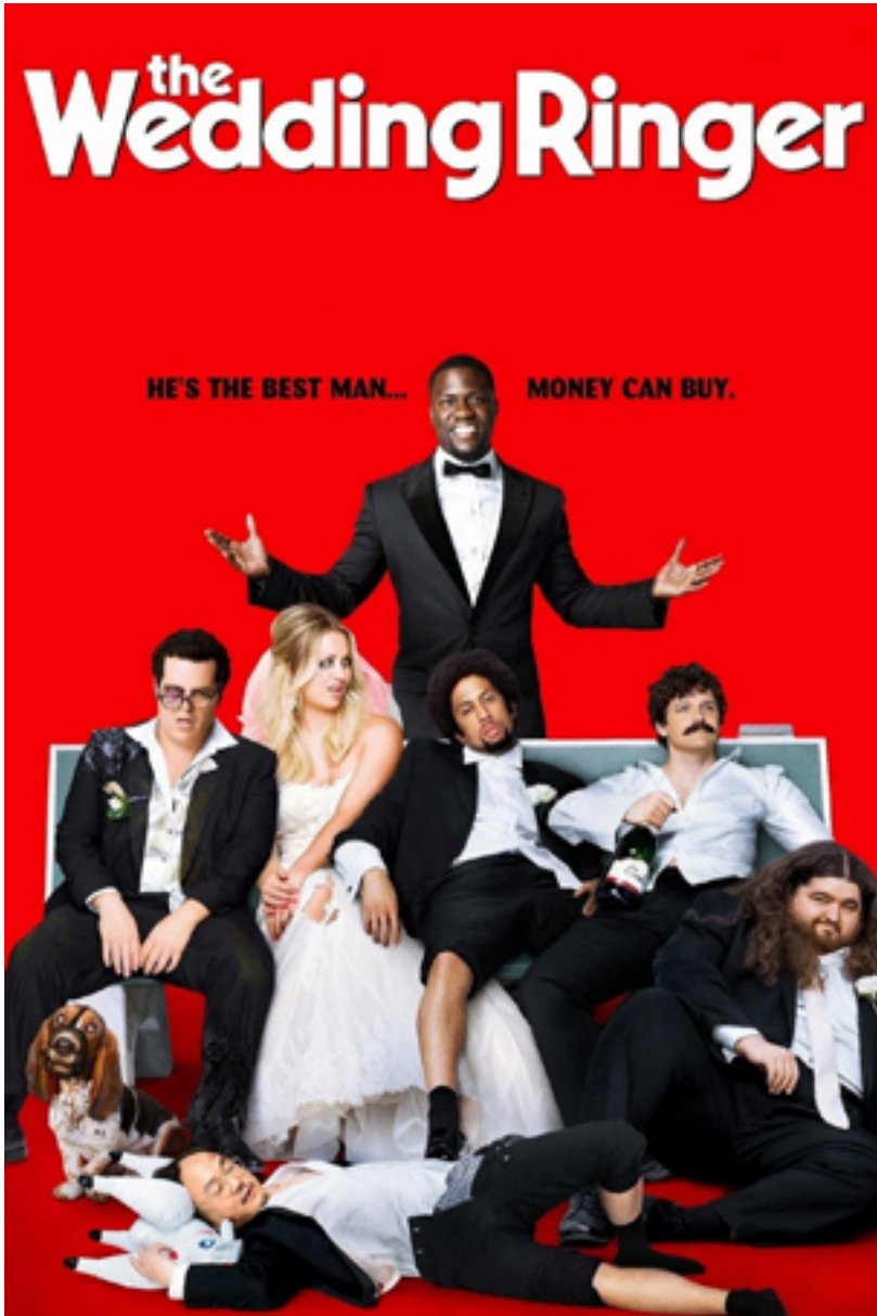
The Wedding Ringer