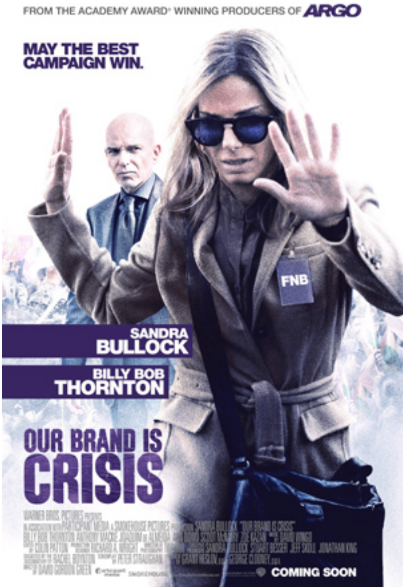
Our Brand Is Crisis