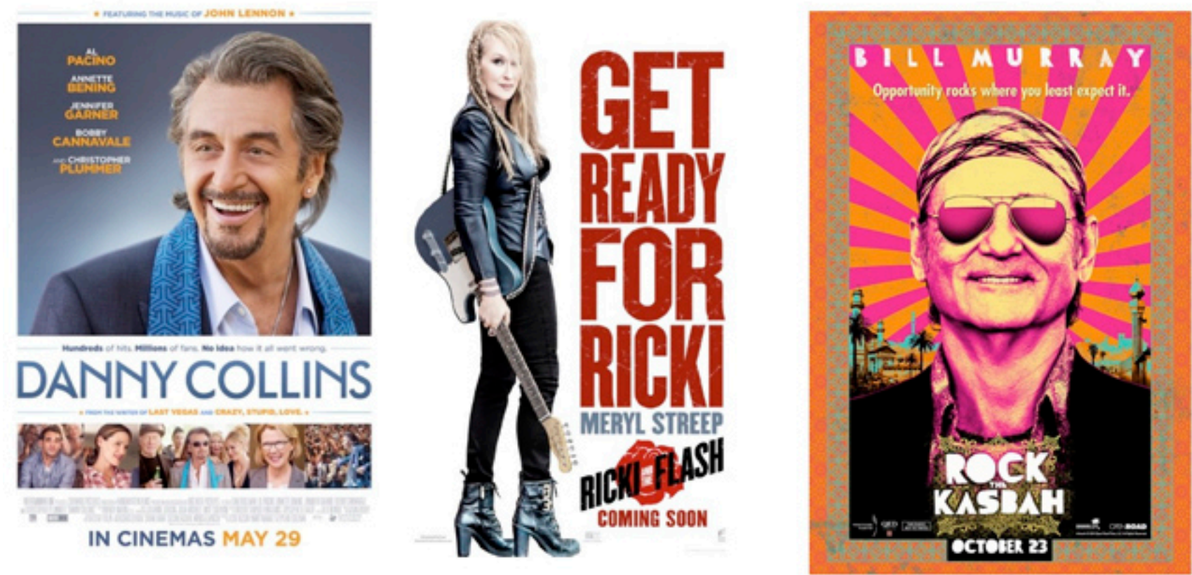
'Danny Collins' 'Ricki and the Flash' 'Rock the Kasbah'

A three-for-one category that exposed a deadly trend in genre filmmaking – old movie stars portraying aging rock ‘n roll characters. “Danny Collins” featured Al Pacino as his “hoo-ha” finest as a rocker trying for redemption in the most awkward and unrealistic way. “Ricki and the Flash” had a horrible script (by “Juno” scribe Diablo Cody), and threw away a stellar cast headed by Meryl Streep as rocker Ricki. And finally, Bill Murray in one of the most misguided and Ugly American old-rocker-themed films, “Rock the Kasbah.” What they all have in common is idiotic stories, while the potential for exploring the 1960s generation in older contemplation is wasted. It can be all summed up by three words – “Al Pacino sings.” (PM)