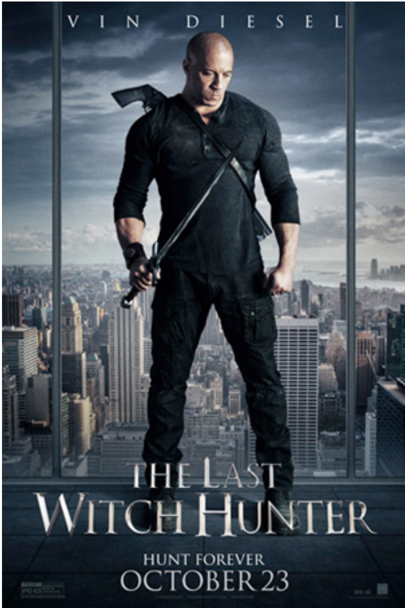
The Last Witch Hunter