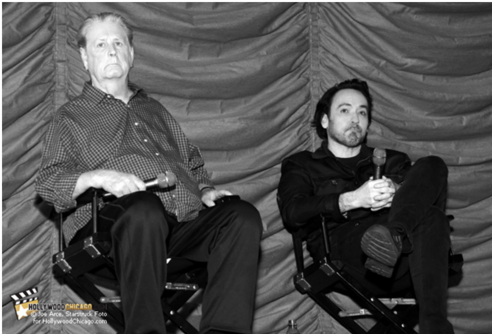
Brian Wilson and John Cusack Take Audience Questions at the Music Box Theater, Chicago, for 'Love & Mercy'