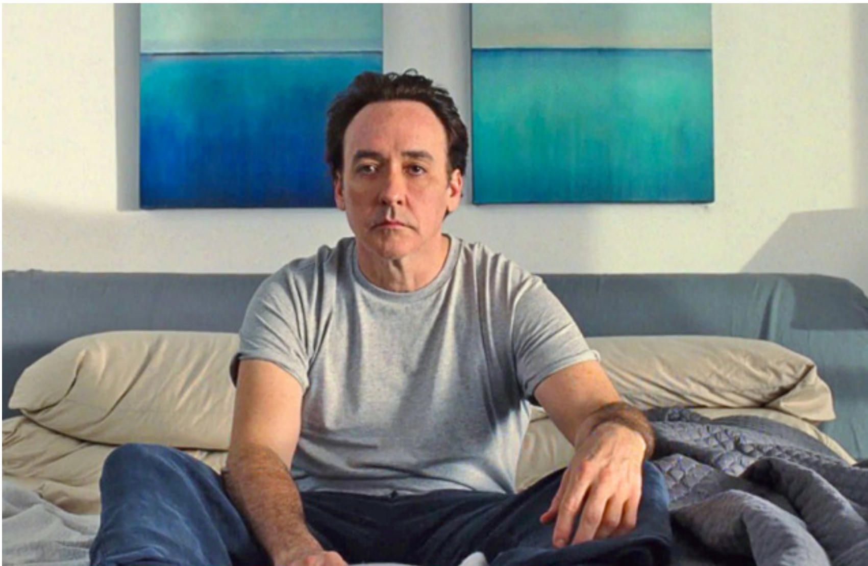
John Cusack as Brian Wilson in ‘Love & Mercy’