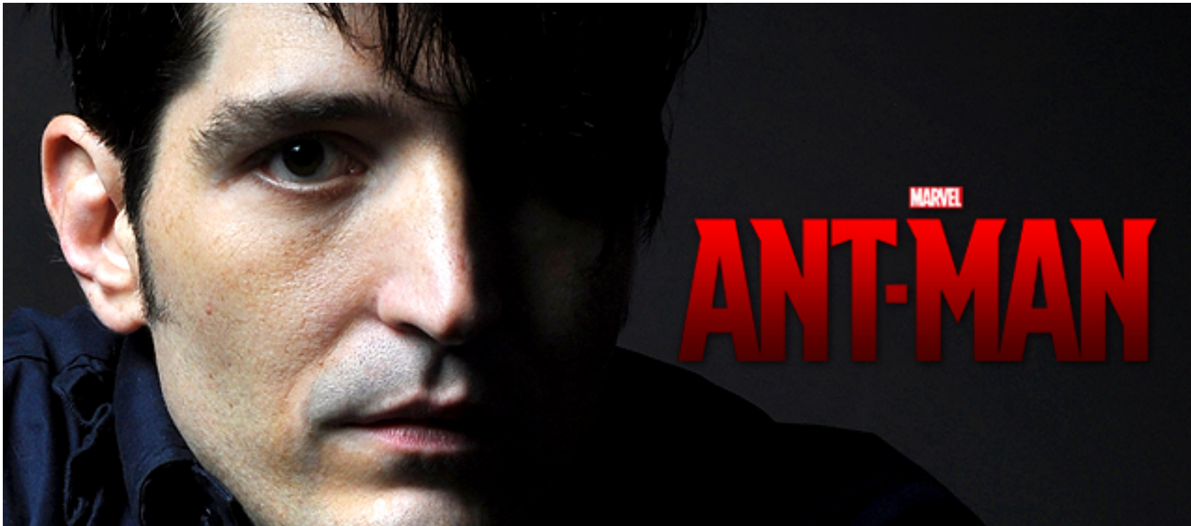
David Dastmalchian in a Promo for the Upcoming 'Ant-Man'

So I waited. I got the call that I was going down to Atlanta to meet up with him. It's a funny story, because they told me I was going to 'test,' which I took to meant I was going to test for the role again with the new director. It gave me a stomach ache. [laughs] I get down there, and I'm sitting in this very nice office with Paul Rudd and the rest of the principals, the producers and new director. I realized it was for the camera tests, and it was a 'welcome aboard' moment. It was a weird way to realize that I finally, with 100 percent certainty, had the job.