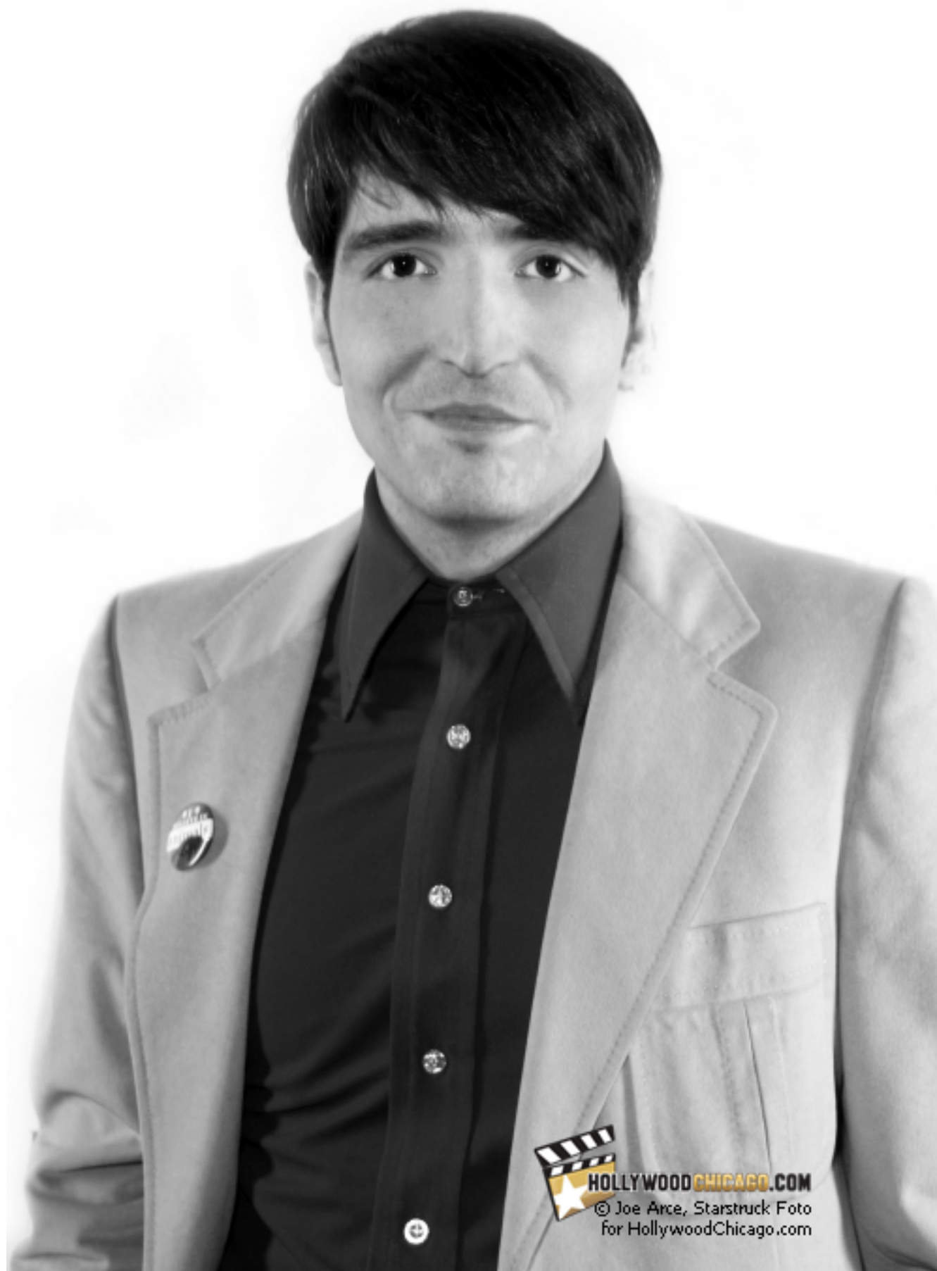
David Dastmalchian of ‘Animals’ at the 2014 Chicago Critics Film Festival