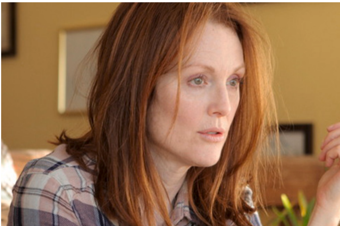
Julianne Moore in ‘Still Alice’

Should Have Been Nominated: Scarlett Johansson “Under the Skin” (PM), Marion Cotillard “The Immigrant” (NA), Emily Blunt “Edge of Tomorrow” (SW).