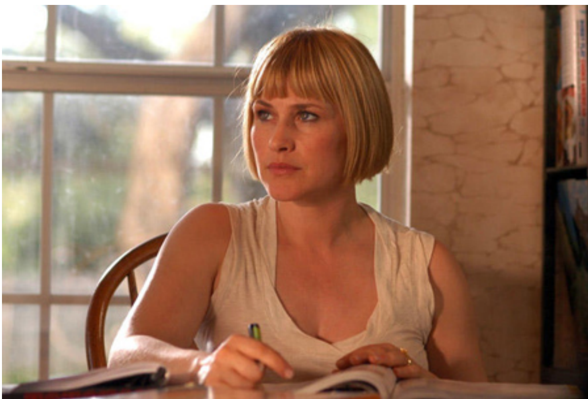
Patricia Arquette in ‘Boyhood’

Should Have Been Nominated: Tilda Swinton “Snowpiercer” (PM), Rene Russo “Nightcrawler” (NA), Jessica Chastain “A Most Violent Year” (SW).