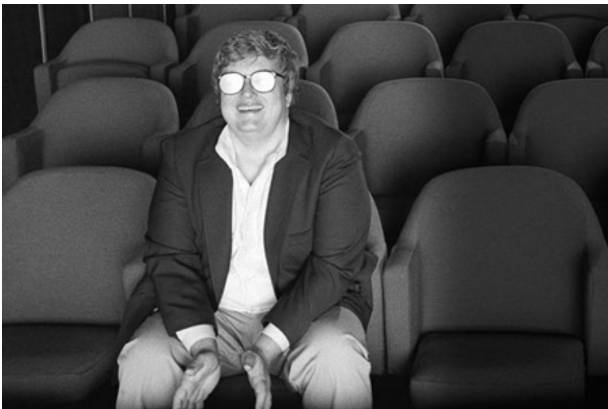
Roger Ebert Lives Forever in 'Life Itself'

The "Life Itself" snub is horrid bad karma for the snub-happy Academy voters. A movie about the movies, featuring the most venerated film critic who ever influenced movie culture, depicting as he STILL contributed while suffering from a debilitating disease. "Yeah, we'll pass..." I hate using the following word, but it's 'literally' unforgivable.