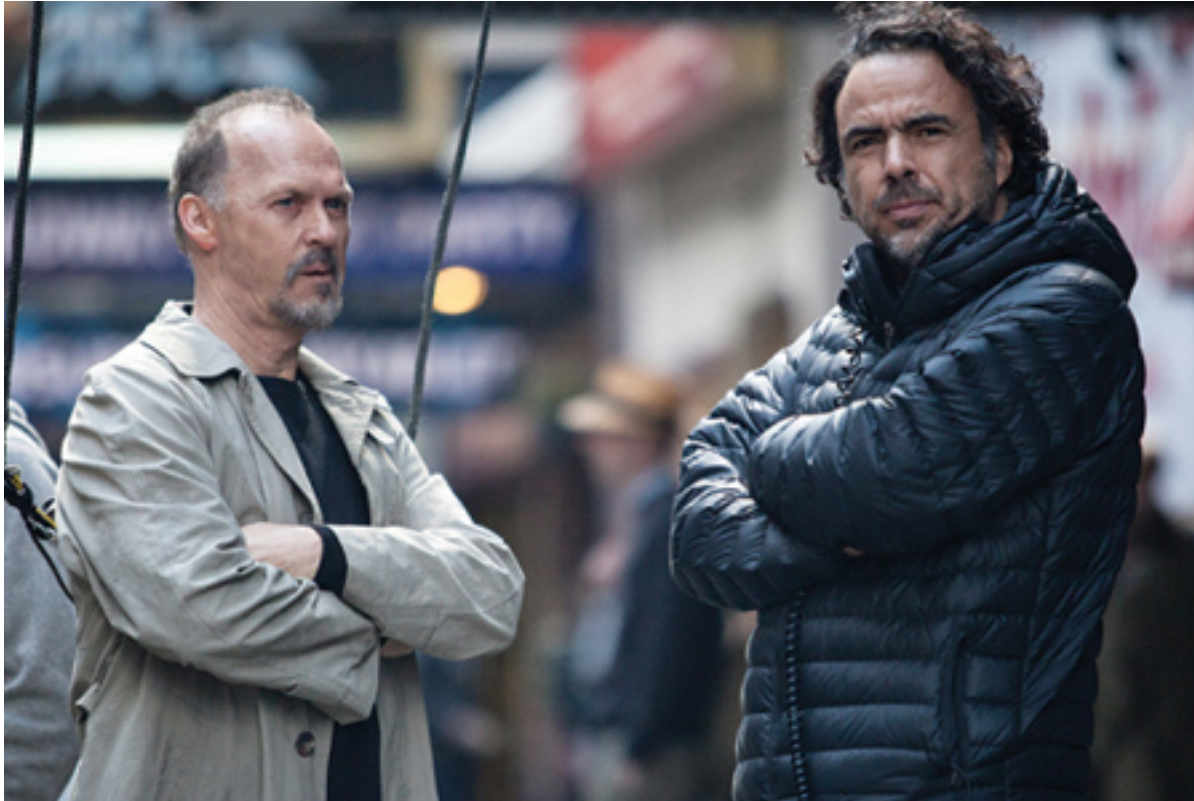
Alejandro González Iñárritu directs 'Birdman'

Should Have Been Nominated: Ava DuVernay "Selma" (PM, NA), Alan Smithee "Blended" (SW)