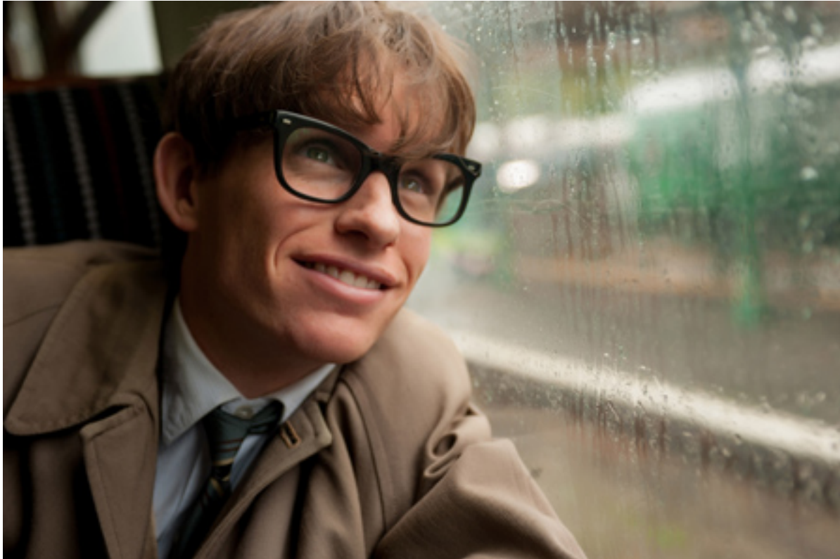
Eddie Redmayne in ‘The Theory of Everything’

Should Have Been Nominated: David Oyelowo “Selma” (PM, NA), Chadwick Boseman “Get on Up” (SW).