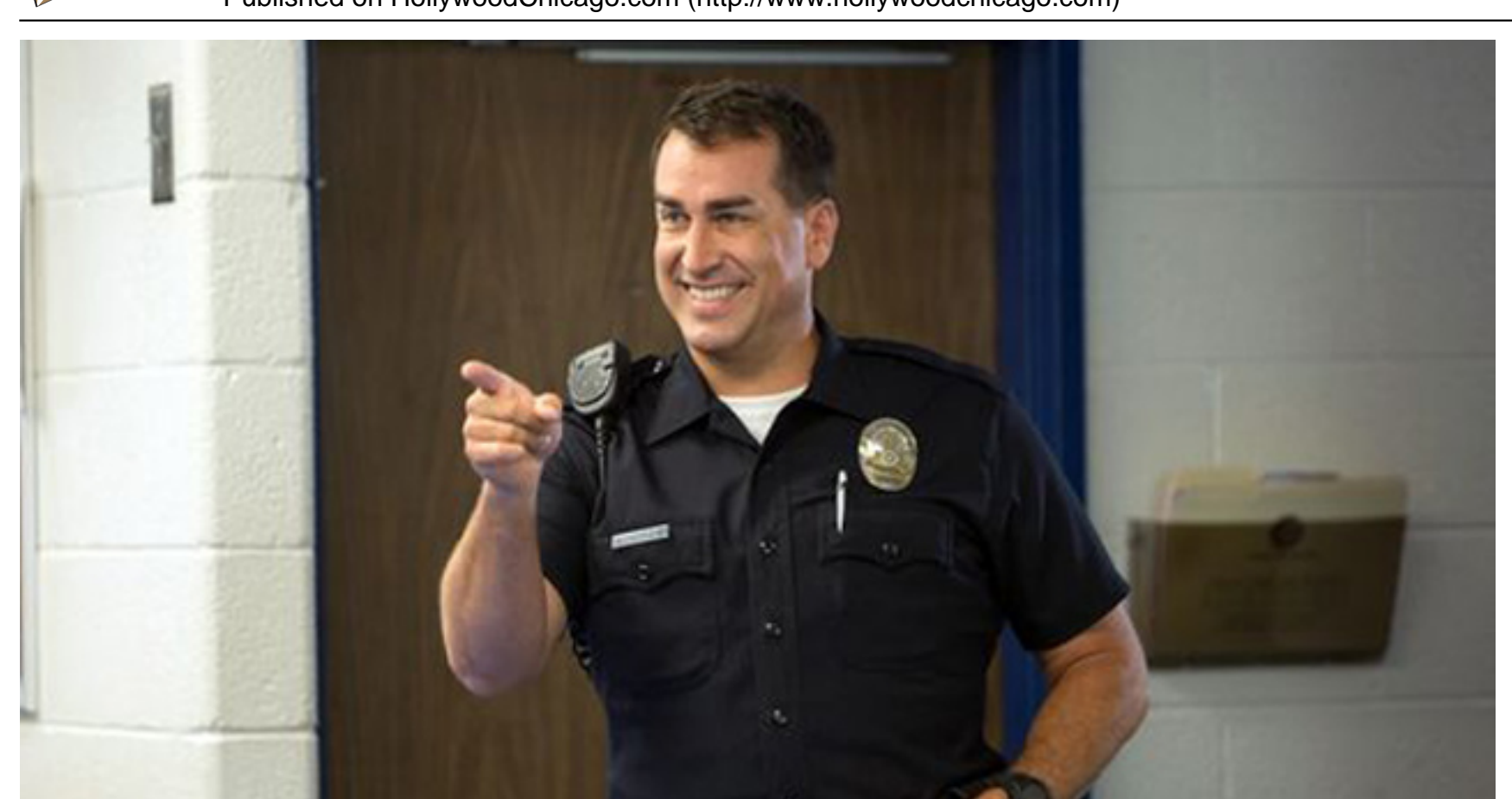
Rob Riggle is Office Segars in 'Let's Be Cops'

HollywoodChicago.com: How many 'takes' of the ending was there?