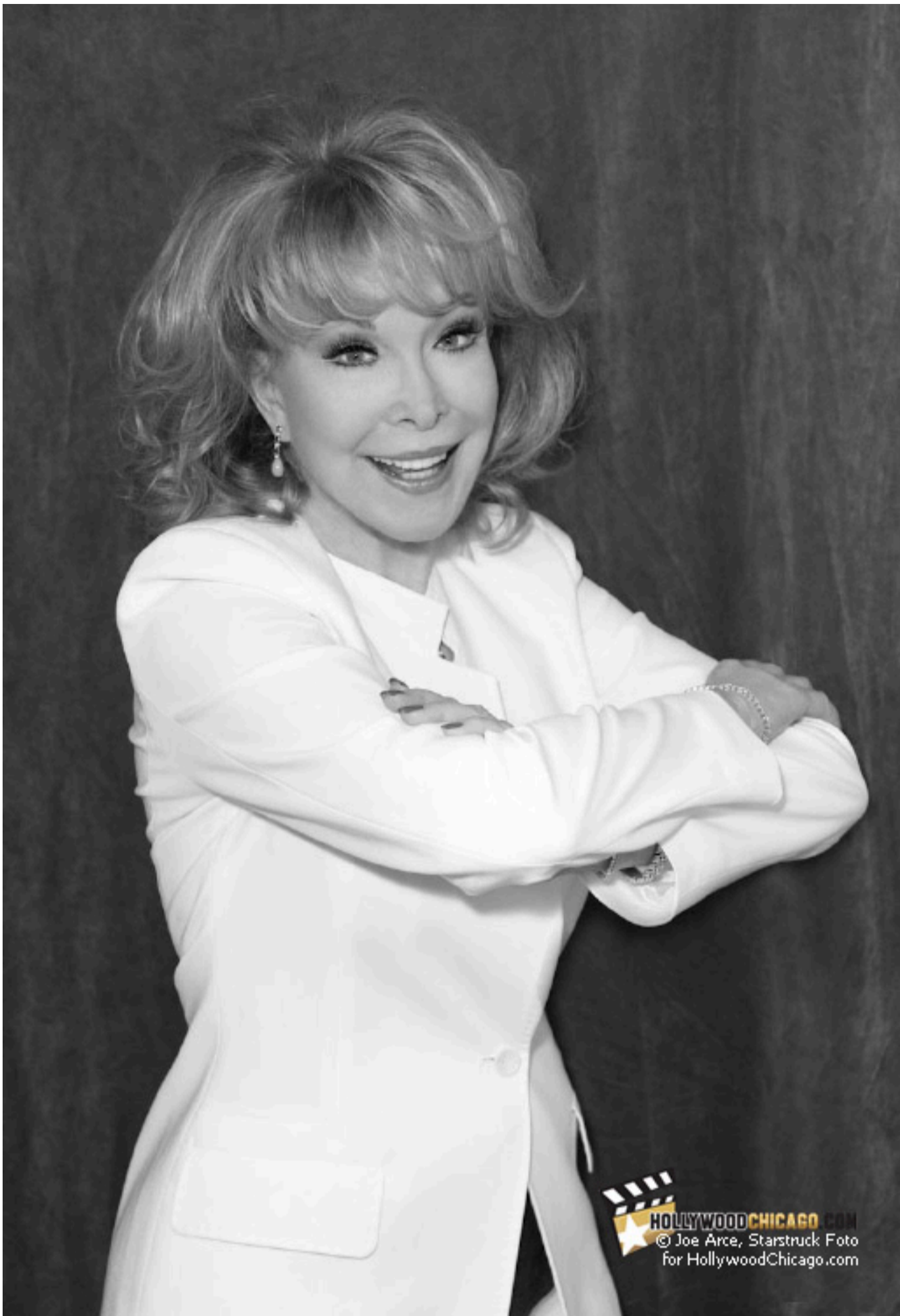
Barbara Eden at the “Hollywood Show Chicago” in 2013