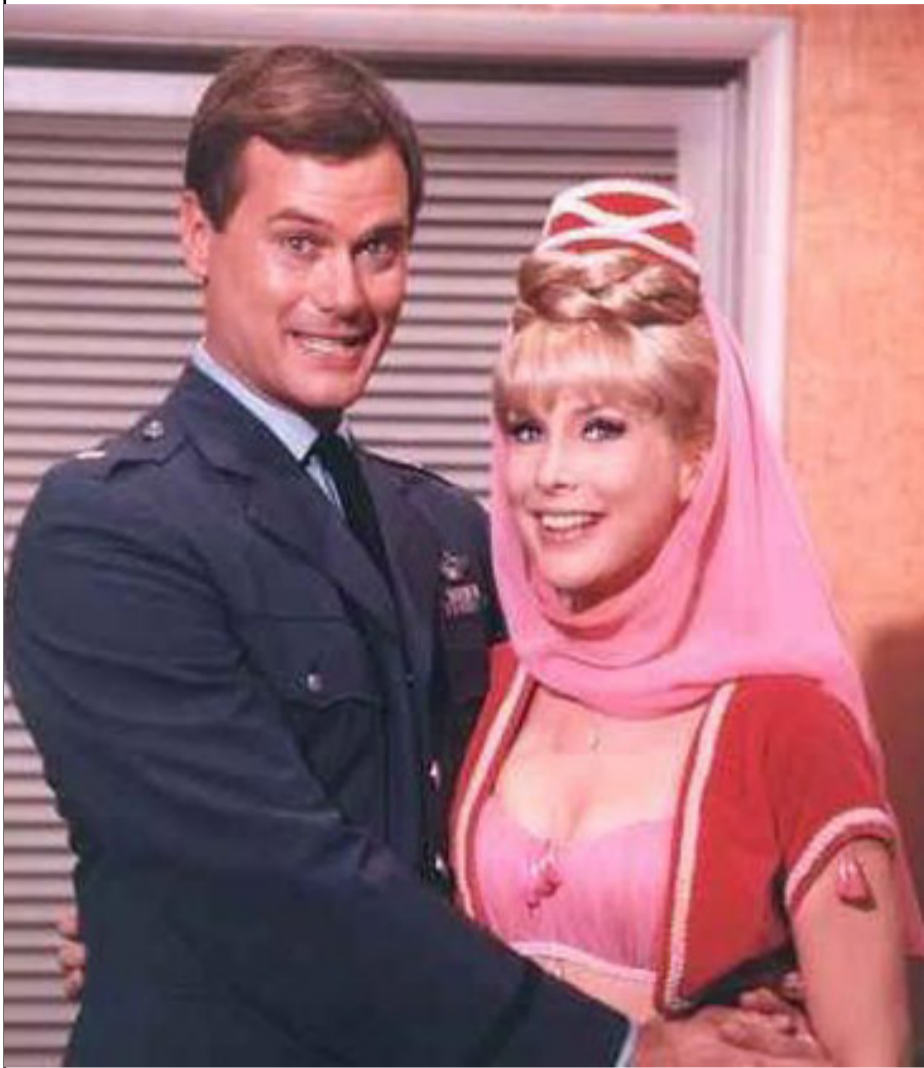
Barbara Eden and Larry Hagman in 'I Dream of Jeannie'

HollywoodChicago.com: You once did a TV movie called 'The Feminist and the Fuzz.' How do you think your life changed because of the feminist movement in the 1960s and '70s?