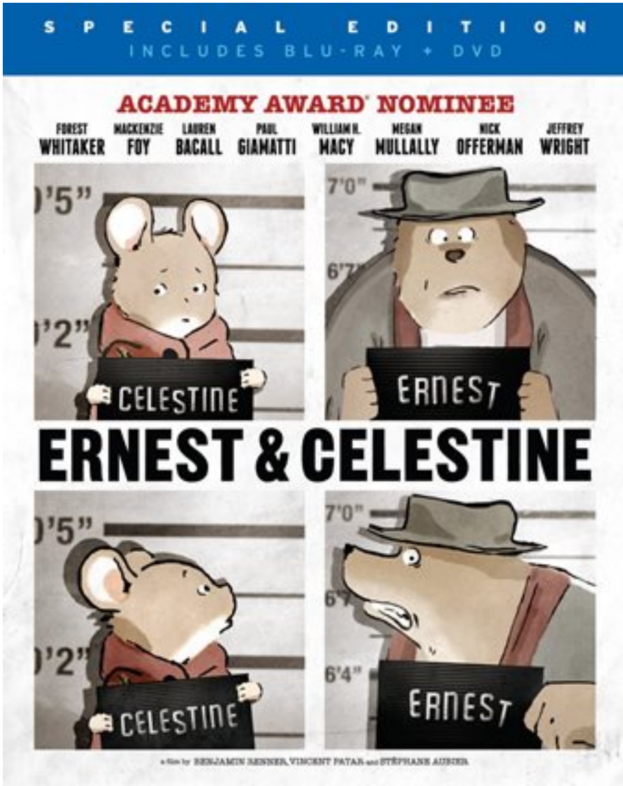
Ernest and Celestine

Deep below snowy, cobblestone streets, tucked away in networks of winding tunnels, lives a tiny mouse named Celestine. Unlike her fellow mice, Celestine is an artist and a dreamer, and has a hard time fitting in. When he nearly ends up as a breakfast for a grumpy bear named Ernest, the two become fast friends and embark on an adventure that will put a smile on your face and make your heart glow.