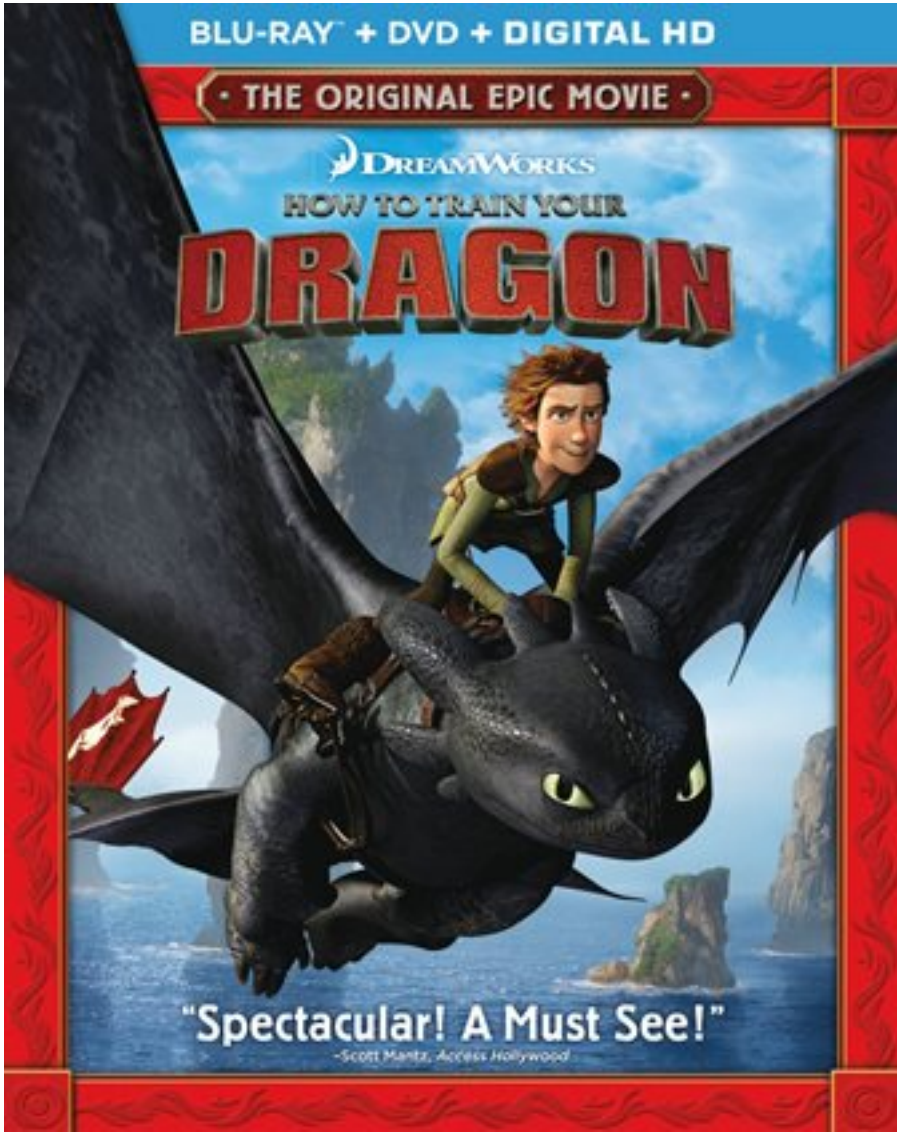
How to Train Your Dragon