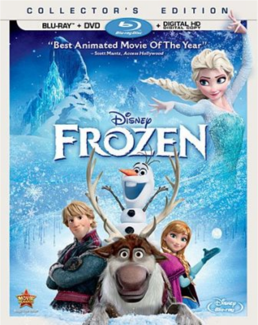
Frozen

An Oscar winner, a major Oscar nominee, two more pieces of Oscar bait, and a few movies that never got anywhere near Oscar. Welcome to What to Watch. We don't play favorites. Oh, wait, yes we do. You should definitely rent or buy the titles on this first page. The second page is more optional.