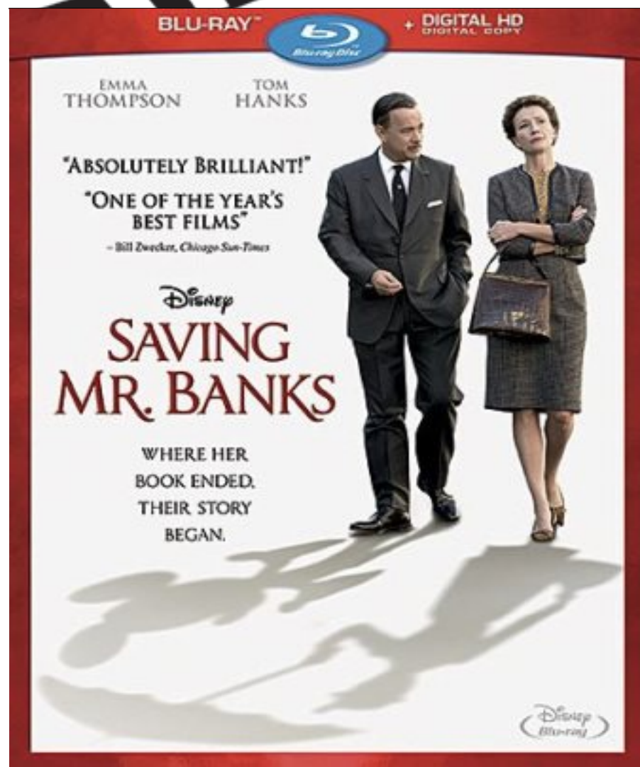
Saving Mr. Banks