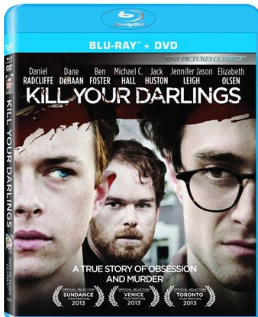
Kill Your Darlings

Where to Watch: Blu-ray, DVD, Vudu, Amazon Instant Streaming, iTunes