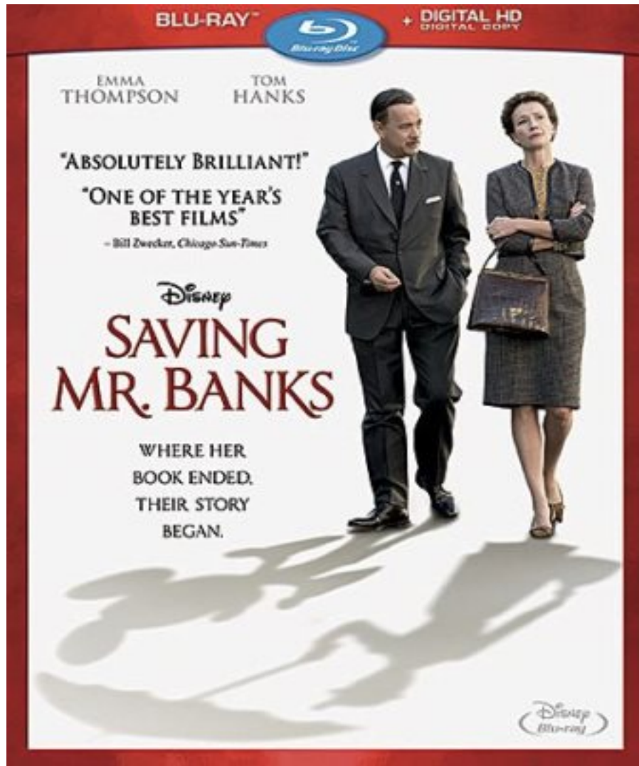
Saving Mr. Banks