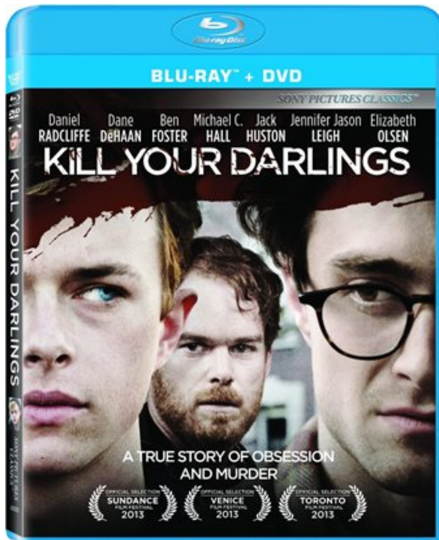
Kill Your Darlings

Where to Watch: Blu-ray, DVD, Vudu, Amazon Instant Streaming, iTunes