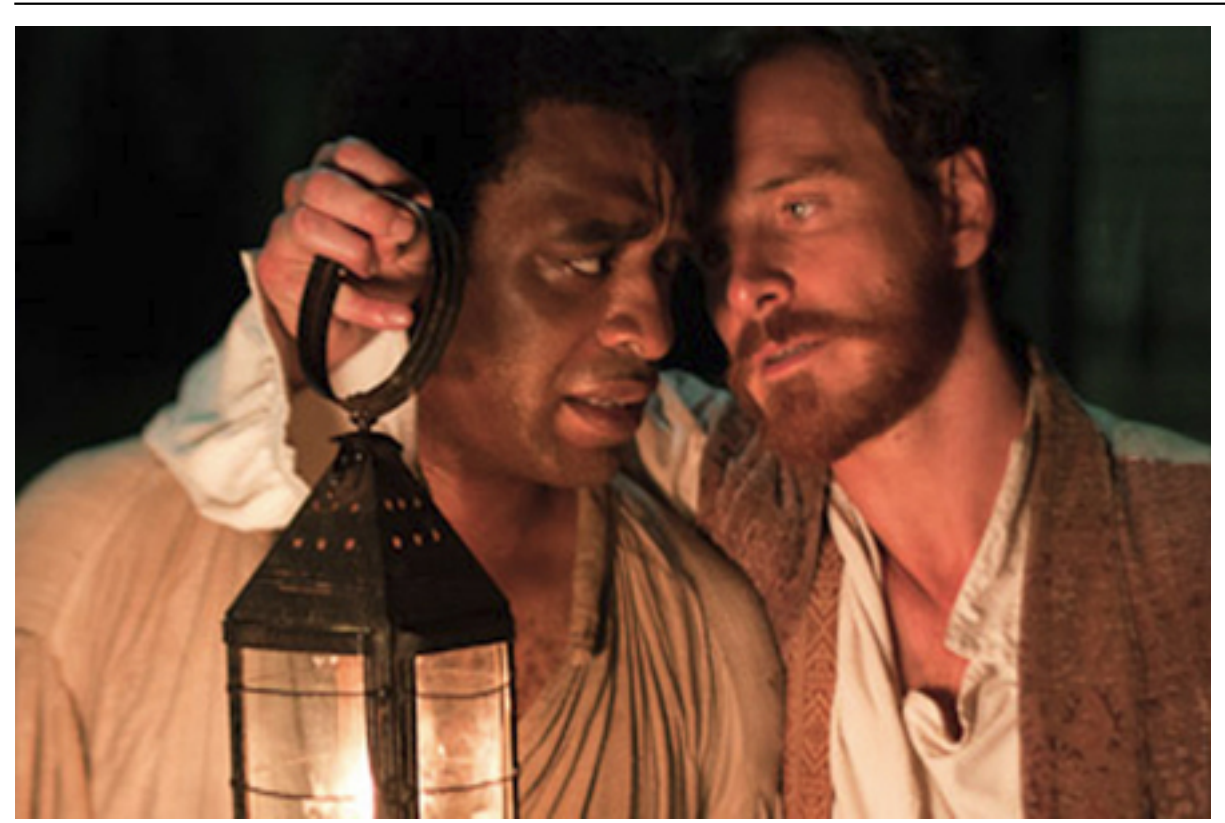
12 Years a Slave

It's a clean sweep for "12 Years a Slave," and Mr. Tallerico is the only dissenter for the SHOULD WIN designation. "'Slave' has been everywhere from the BAFTA coverage to the magazines around the world. It's time." (BT) "'Philomena' is making me more nervous than I would have been three months ago ..." (NA) "'12 Years A Slave' takes the concept of a historical bio pic and strips it down to its most empathetic and powerful." (DC)