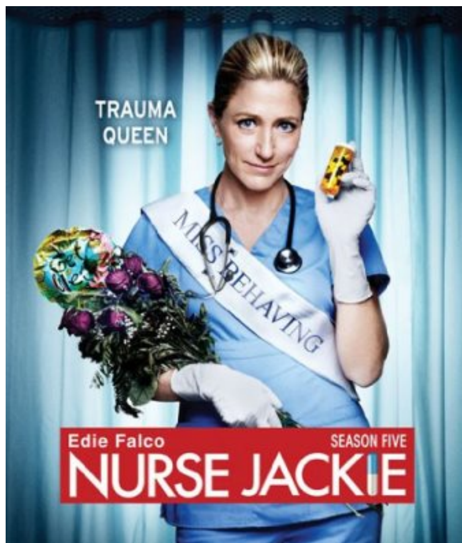
Nurse Jackie: Season Five