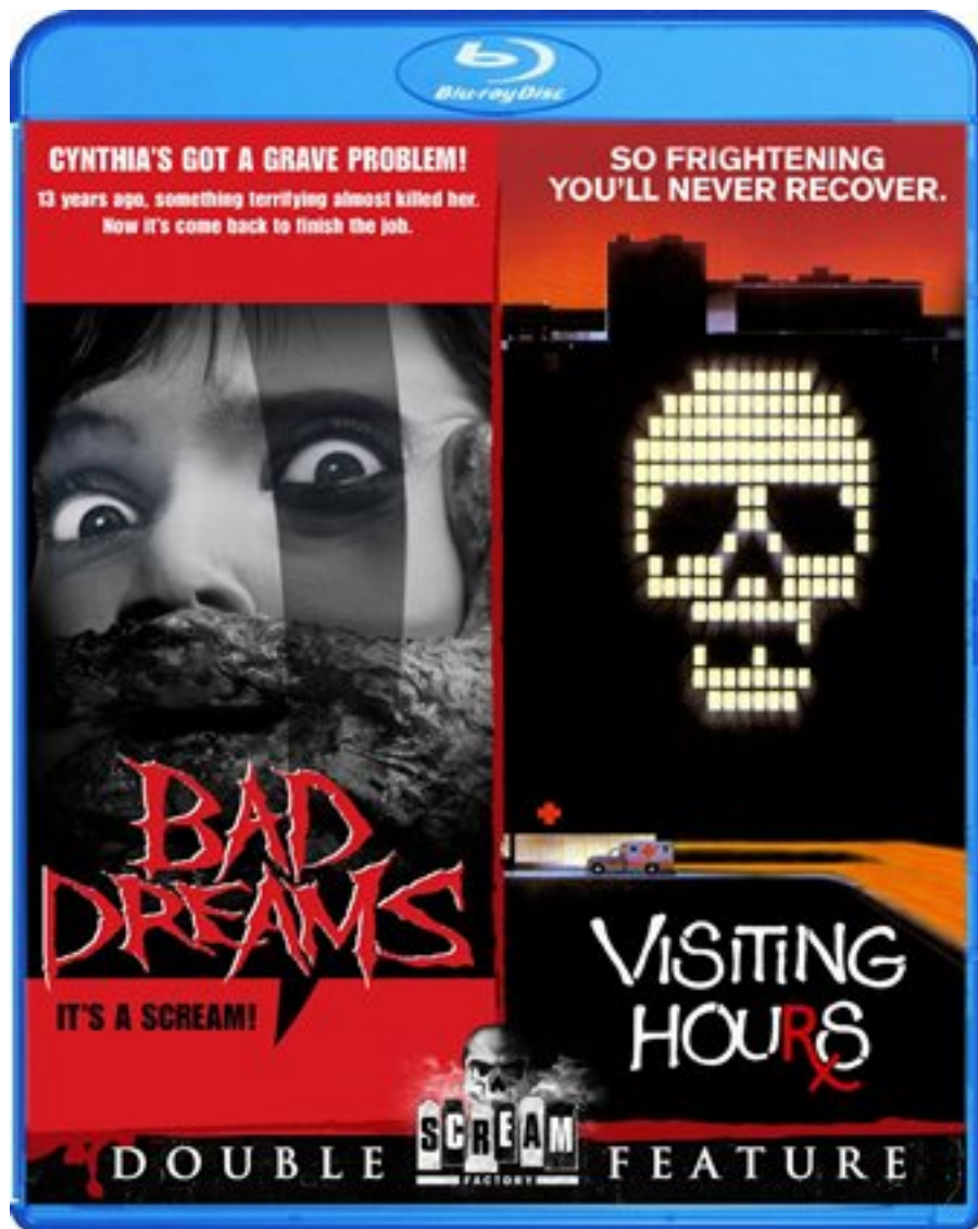
Bad Dreams/Visiting Hours