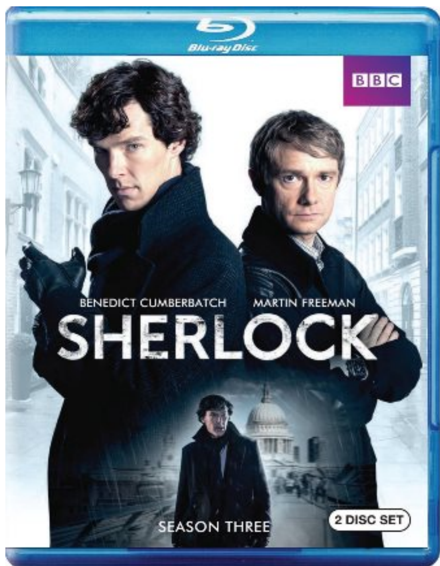
Sherlock: Season Three

Where to Watch: Blu-ray, DVD, Vudu, Amazon Instant Streaming, iTunes