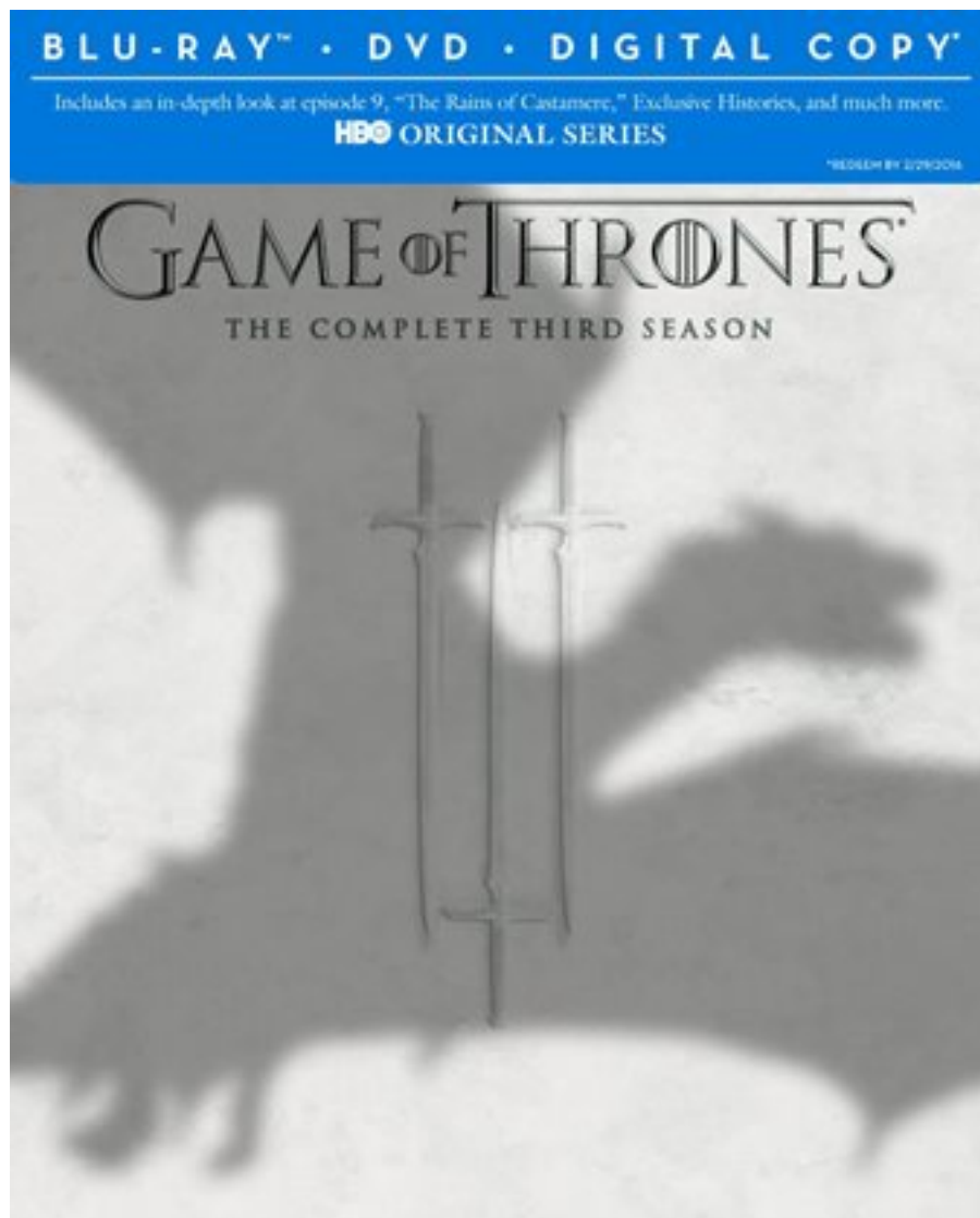
Game of Thrones: The Complete Third Season

What an amazing week for TV fans. As if you didn't have enough stacking to do with the new, brilliant season of "House of Cards" on Netflix, there are four other full seasons in this week's What to Watch that you really should watch front to back. And then there's the still-amazing "Darkman," a cult classic that perfectly captures Sam Raimi's skill at controlled chaos. Finally, we have two '80s horror flicks in one set in "Bad Dreams" and "Visiting Hours." Check 'em all out (OK, you can skip the genre stinkers).