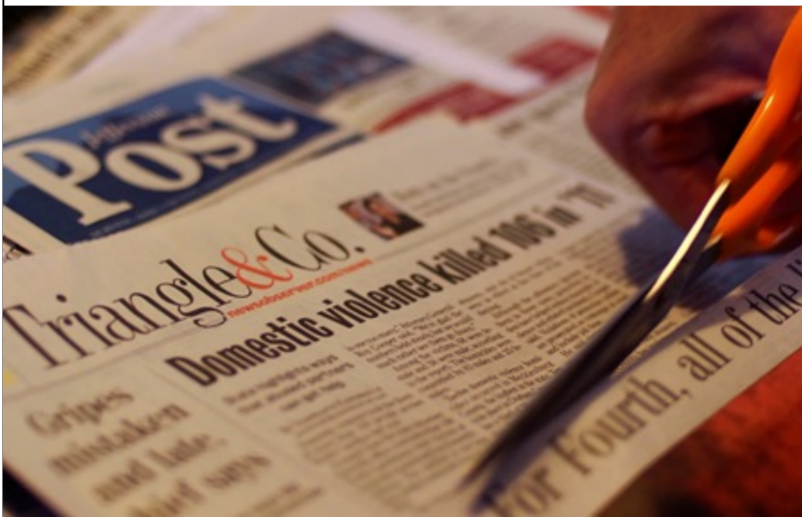
Private Violence

How does a visual medium represent someone losing their sight? Sound design. Focus on touch. Close-ups of faces, arms, fingers, chests. It becomes a very sensual film and then it becomes a fantastical one. It is a work about loneliness, longing, lust, passion. A few of the beats seem a bit on-the-nose and the symbolism can be hit a little too bluntly at times but the performances are daring and the narrative fascinating. I'll be happy if I can say that about more films at Sundance 2014.