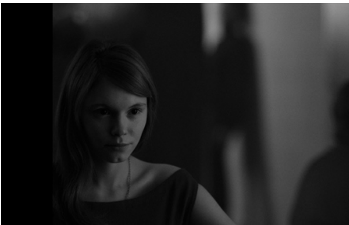
Ida

So will "Ida" . Pawel Pawlikowski, the director of "Last Resort" and "My Summer of Love," has already taken this striking drama to international film festivals, drawing the attention of Music Box Films who will release it later this year. It is 1960s Poland and Anna (the stunning Agata Trzebuchowska) is about to take her final vows at the convent in which she was raised. Before she does so, her superior believes she should meet her family. The only connection she has back to the real world, after being left as a baby on the steps of the church, is her aunt, Wanda Gruz (Agata Kulesza), who has ignored her existence for years. Anna finds Wanda and learns that not only is she Jewish but that her parents were killed in the war. The two go to try and find their bodies.