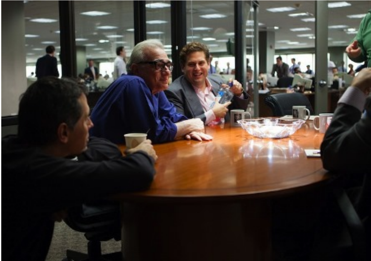
Martin Scorsese on the set of The Wolf of Wall Street

Martin Scorsese, The Wolf of Wall Street