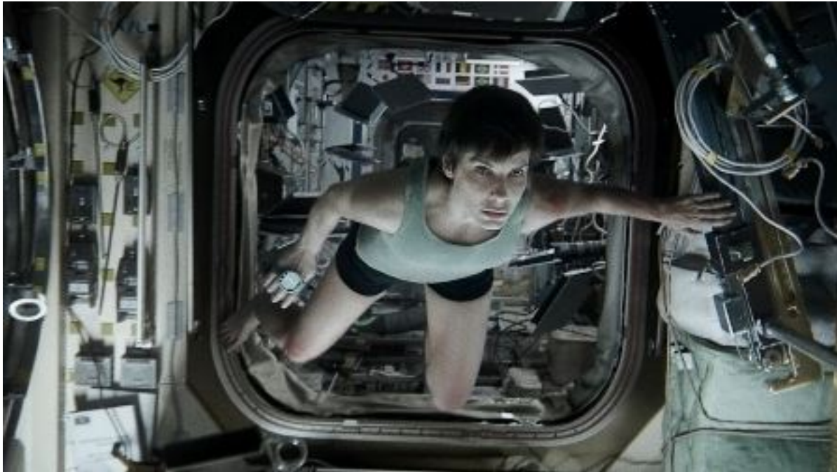
Sandra Bullock as Ryan Stone in Gravity