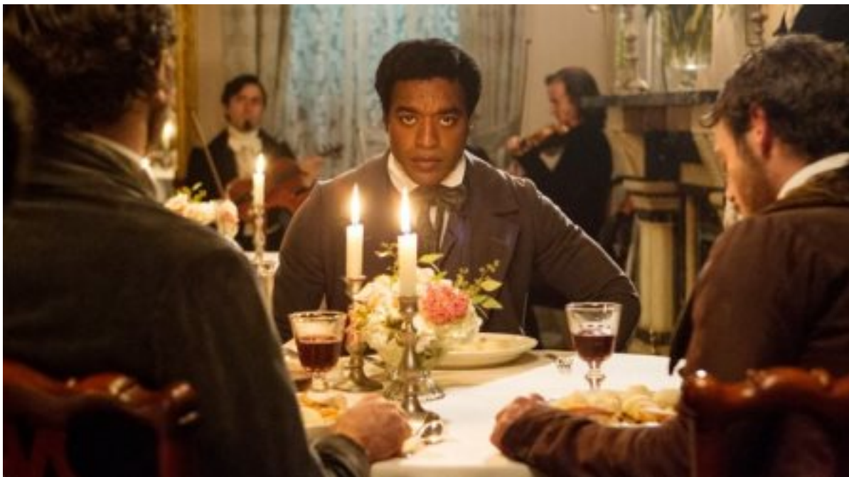
Chiwetel Ejiofor as Solomon Northup in 12 Years a Slave