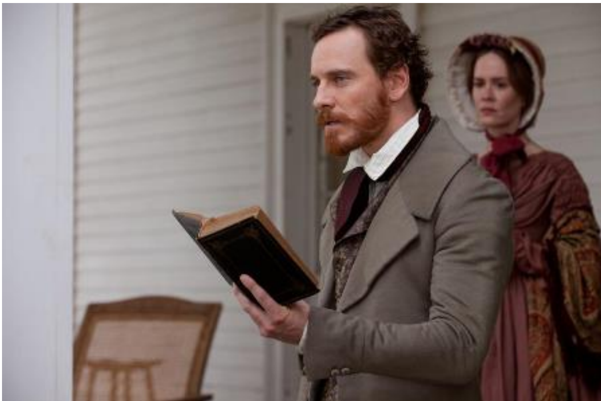
Michael Fassbender as Edwin Epps in 12 Years a Slave