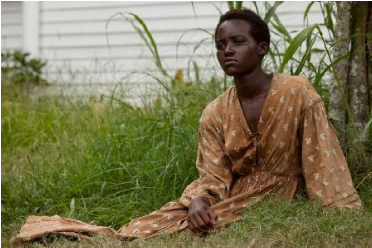
Lupita Nyong'o as Patsey in 12 Years a Slave

I so want to go out on a limb here and predict that “Dallas Buyers Club” will ride a wave of recent support all the way to a nod for Jennifer Garner but the stats don’t quite support it and I can’t figure out who to kick out. These have been the presumptive five for so long that I have them memorized. And, no, the Academy is not ready to get behind the great voice-only work by Scarlett Johansson and nominate her, even if some of the critics groups did. It’s these five. Yawn. I hope I’m wrong here and it’s not even Garner or Scarlett. Let’s go completely out of left field. Did y’all see “Blue is the Warmest Color”?