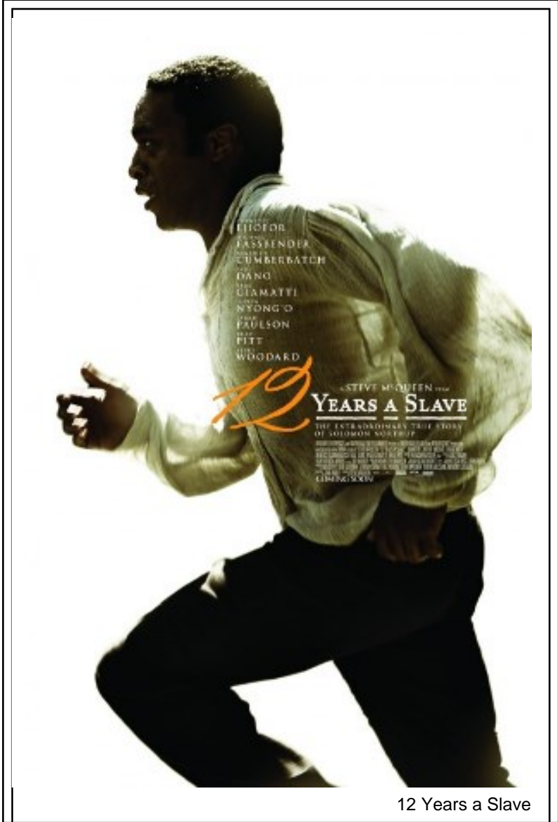
12 Years a Slave

The rest of the categories, without semi-witty commentary, on page two.