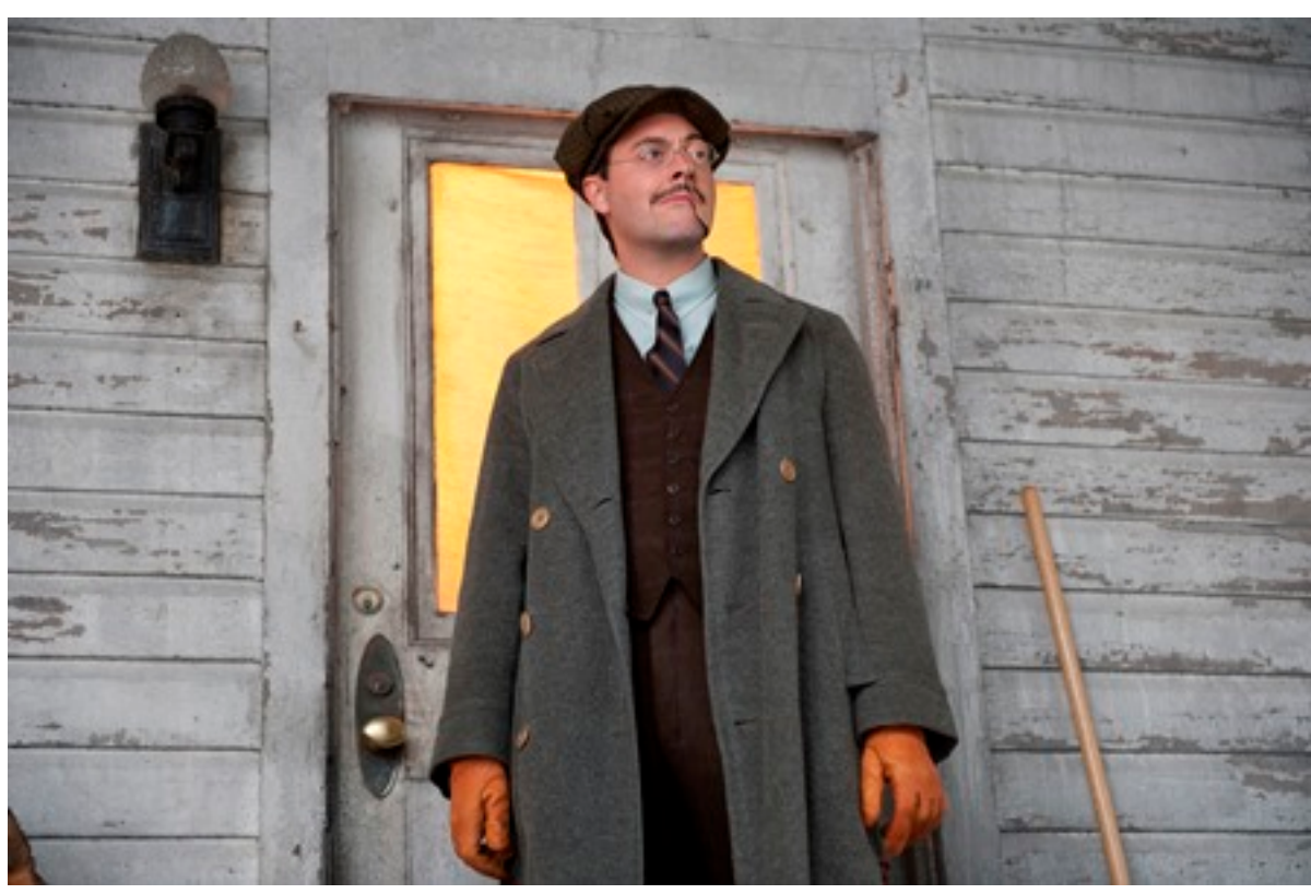
Boardwalk Empire

—Episode 4.9, "Marriage and Hunting," 11.3.13