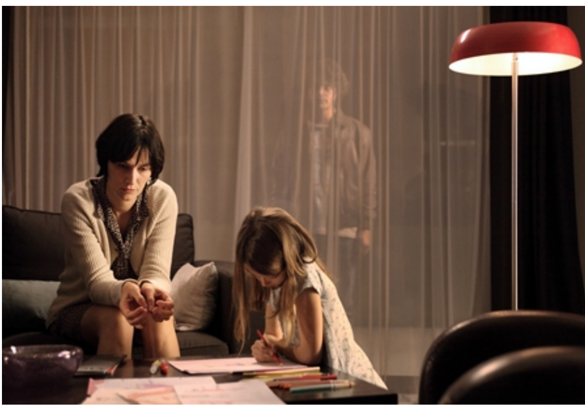
The Returned