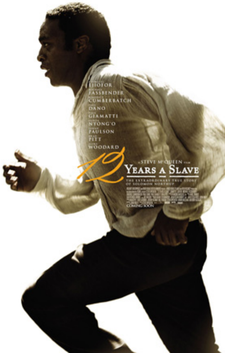
12 Years a Slave