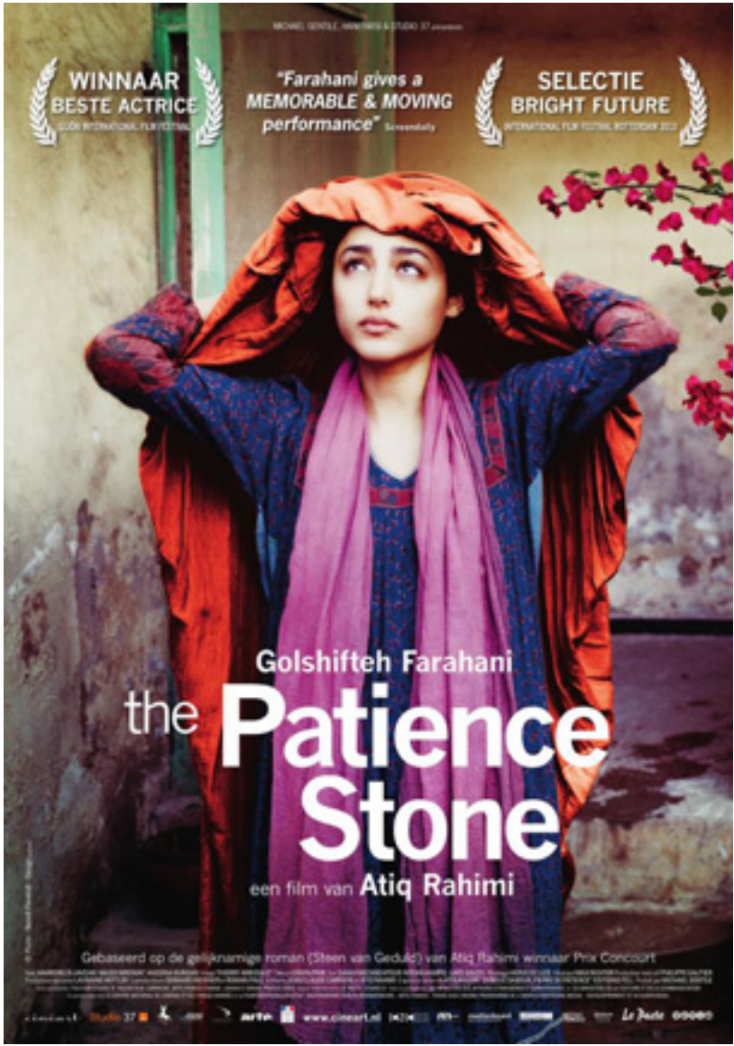
The Patience Stone

Produced by Afghanistan, France, Germany and Britain in 2012, and garnering a limited release in the U.S. in 2013, this emblematic cinema survey of religion, war and women’s societal status is stunning in what it accomplishes. It’s a story set in a war zone, the type of war zone that the United States has become very familiar with in the last ten years. A soldier, who is also a husband, has been shot and injured, and is in a vegetative state. As his wife and child must flee as the street fighting comes to their home, the wife comes back to care for her stricken mate. To pass the time, she uses the non-responsive companion as a “patience stone,” the symbolic inanimate object that absorbs all of her confessions. The secrets that are revealed are indicative of a woman’s plight in such a time and place, and the truth that spills forth changes everything. Director Atiq Rahimi adapted her own novel, and visualizes the story as an evolution revolution, and uses her woman character (Golshifteh Farahani) as all women.