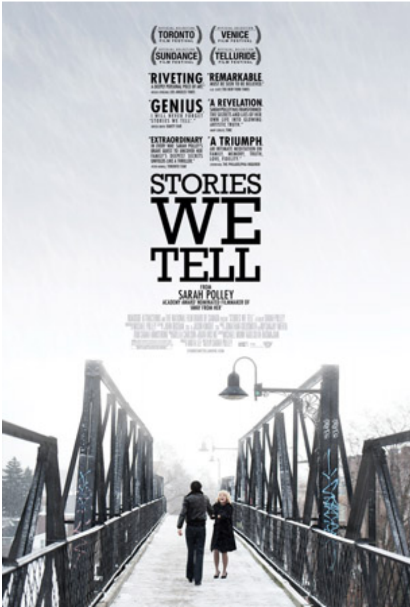
Stories We Tell

Actress/Filmmaker Sarah Polley fashions a unique documentary essentially about herself – and structured it in a way as to reveal as much as she can about the subject. She delves deeply into family secrets and uncovers more than she might have bargained for, but tells the story so directly and passionately that all forgiveness and freedom derived from these truths are realized. The story also has such a fluidness and rhythm that even the twists and surprises seem natural to how it flows. The honesty that Polley displays with her own story is indicative of a maturing filmmaker, one who is on a path to a major work of cinematic art.