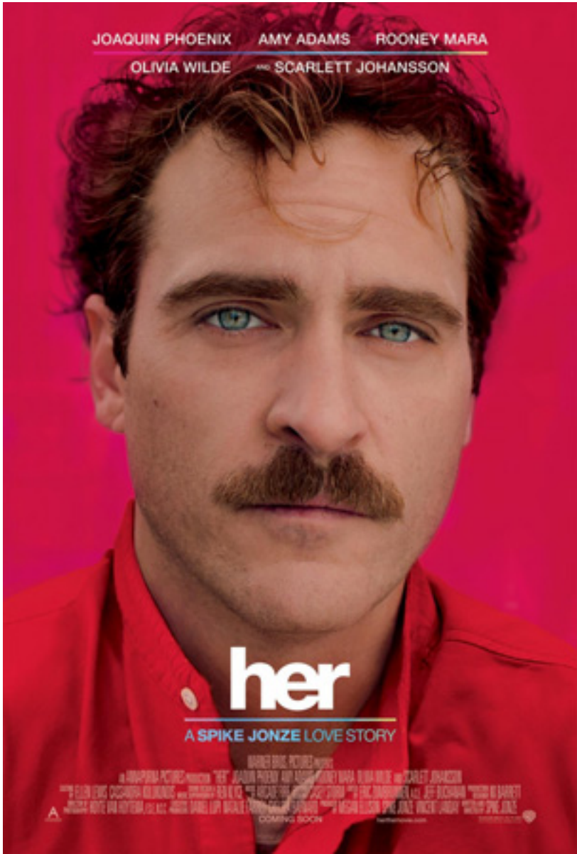
Her

I have seen the near future, and it is “Her.” In what is a natural step in the technological revolution process that we’re all going through, writer/director Spike Jonze imagines an operating system that becomes a companion. Joaquin Phoenix plays a relationship-challenged man who falls in love with the digital intelligence that exists to please him, and as in all relationships in which one partner develops faster and alternately than the other, it is doomed to difficulty. This science fiction exploration is also creepily familiar, as we gather our electronic devices and develop relationships with them. As machines are beating our human grandmasters in chess, who is to say that they won’t someday surpass us in other-worldly experiences? There is hope in Spike Jonze’s scenario, if only we’re willing to seek it.