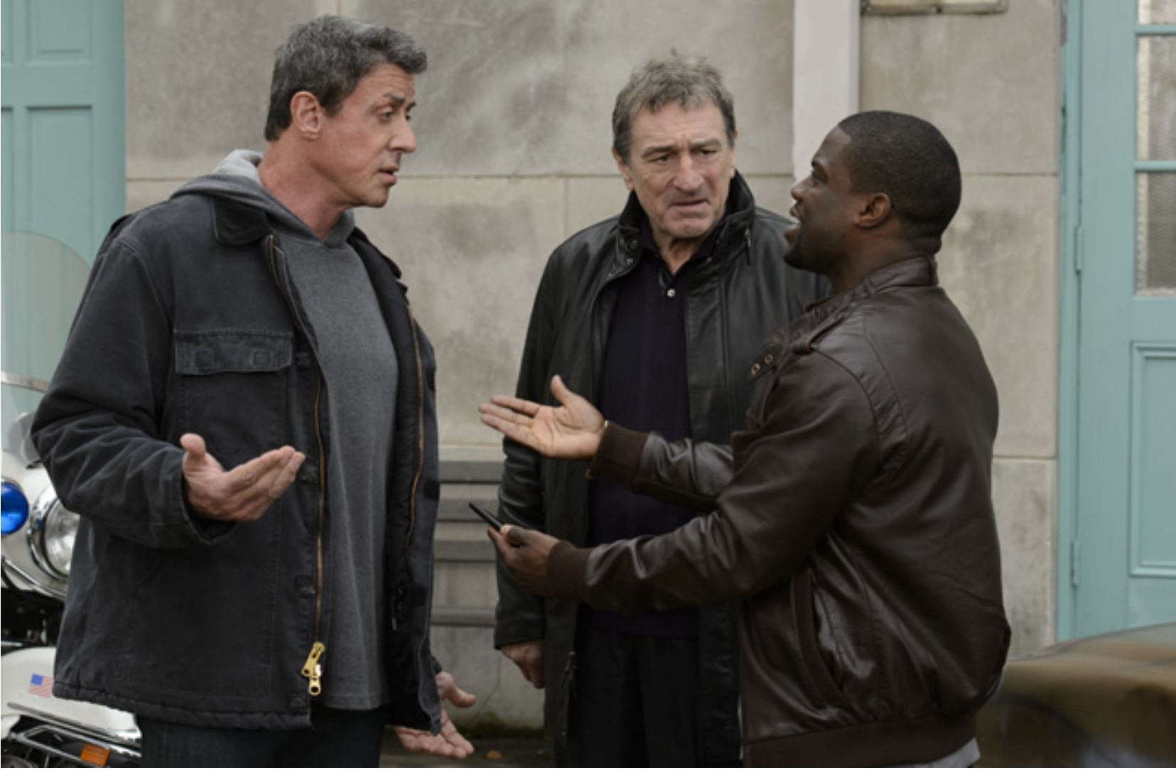
Sharp (Sylvester Stallone), McDonnen (Robert De Niro) and Slate (Kevin Hart) in ‘Grudge Match’