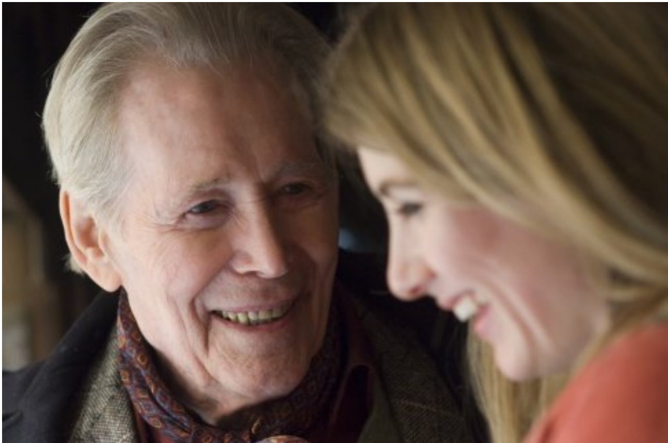
Peter O'Toole in 'Venus' (2006)