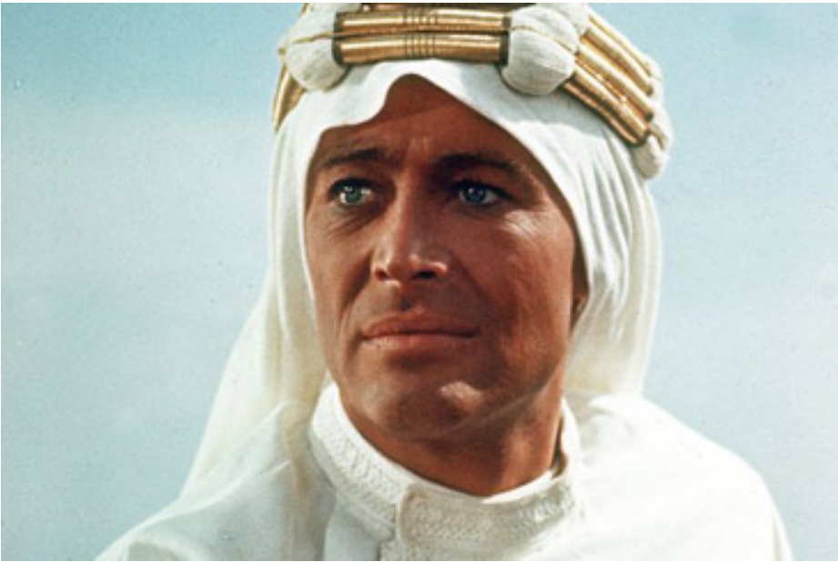
Peter O'Toole in 'Lawrence of Arabia'

He was adept in all styles of acting, from romantic comedy (“How to Steal a Million”), to Shakespearian seriousness (“Becket), to farce (“The Ruling Class”). He even did two musicals, an adaptation of “Goodbye Mr. Chips” (1969) and the maligned “Man of La Mancha” (1972). He had three late career Oscar Best Actor nominations for “The Stunt Man” (1980), “My Favorite Year” (1982) and the before mentioned “Venus” (2006).