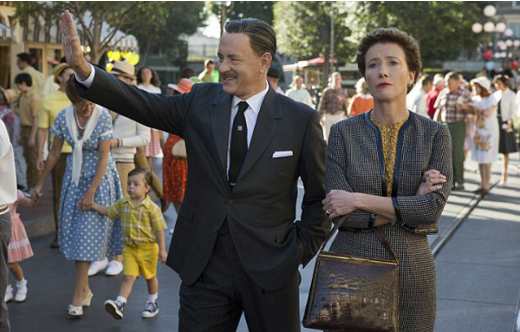
Walt Disney (Tom Hanks) and P.L. Travers (Emma Thompson) Visit Disneyland in ‘Saving Mr. Banks’