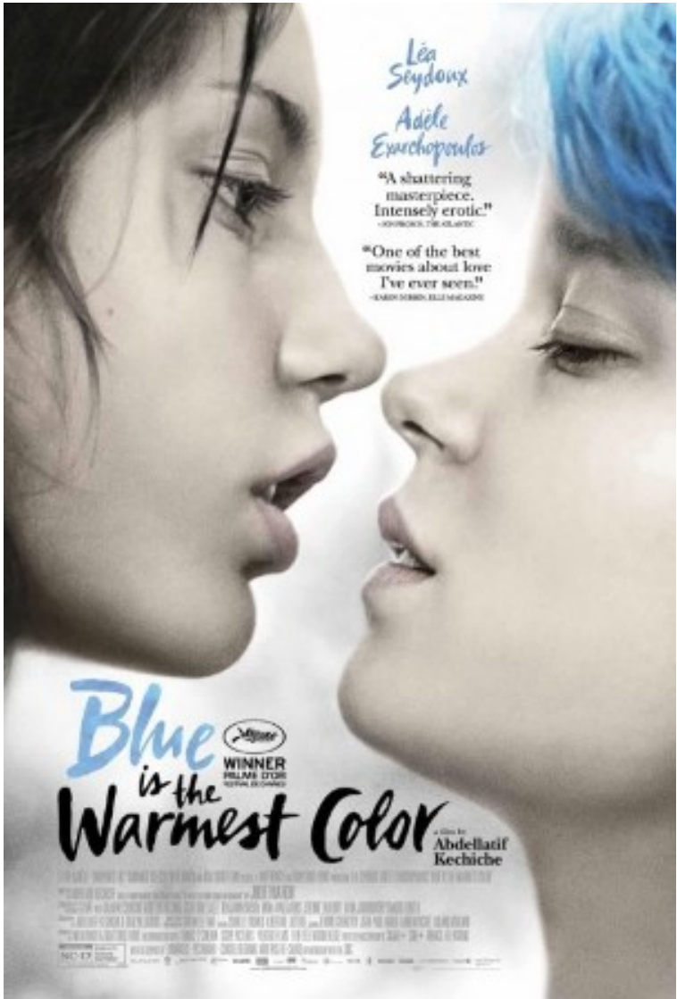
Blue is the Warmest Color