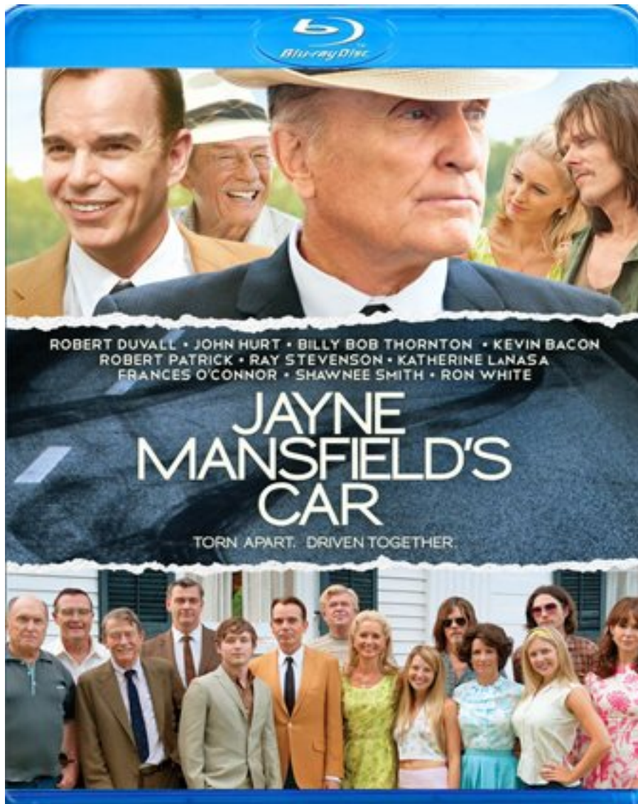
Jayne Mansfield's Car