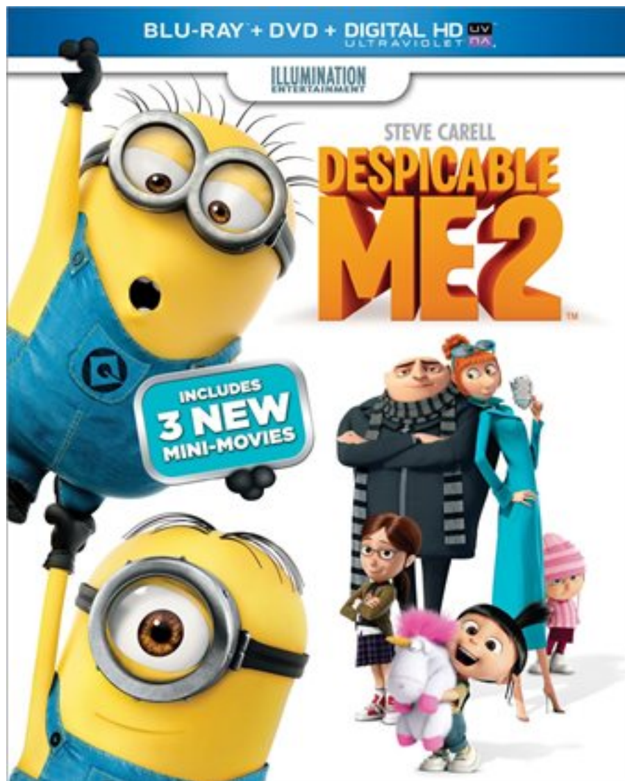
Despicable Me 2