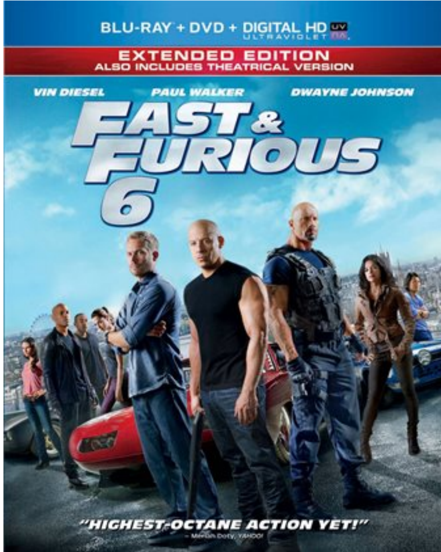
Fast and Furious 6: Extended Edition

Where to Watch: Blu-ray, Vudu, Amazon Instant Streaming, iTunes