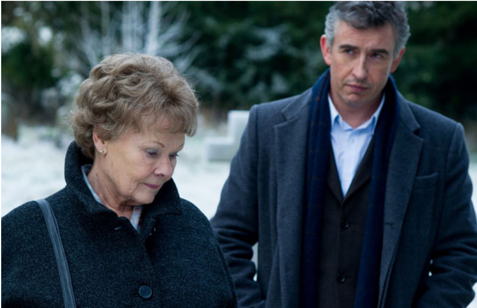
Philomena (Judi Dench) and Martin (Steve Coogan) Contemplate Destiny in 'Philomena'