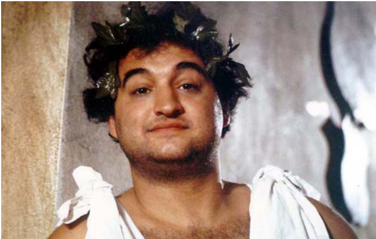
Toga! John Belushi as Bluto in ‘Animal House’

Belushi: He could do a deep sigh, just like his father. That, and brooding, he picked up both those things very well.