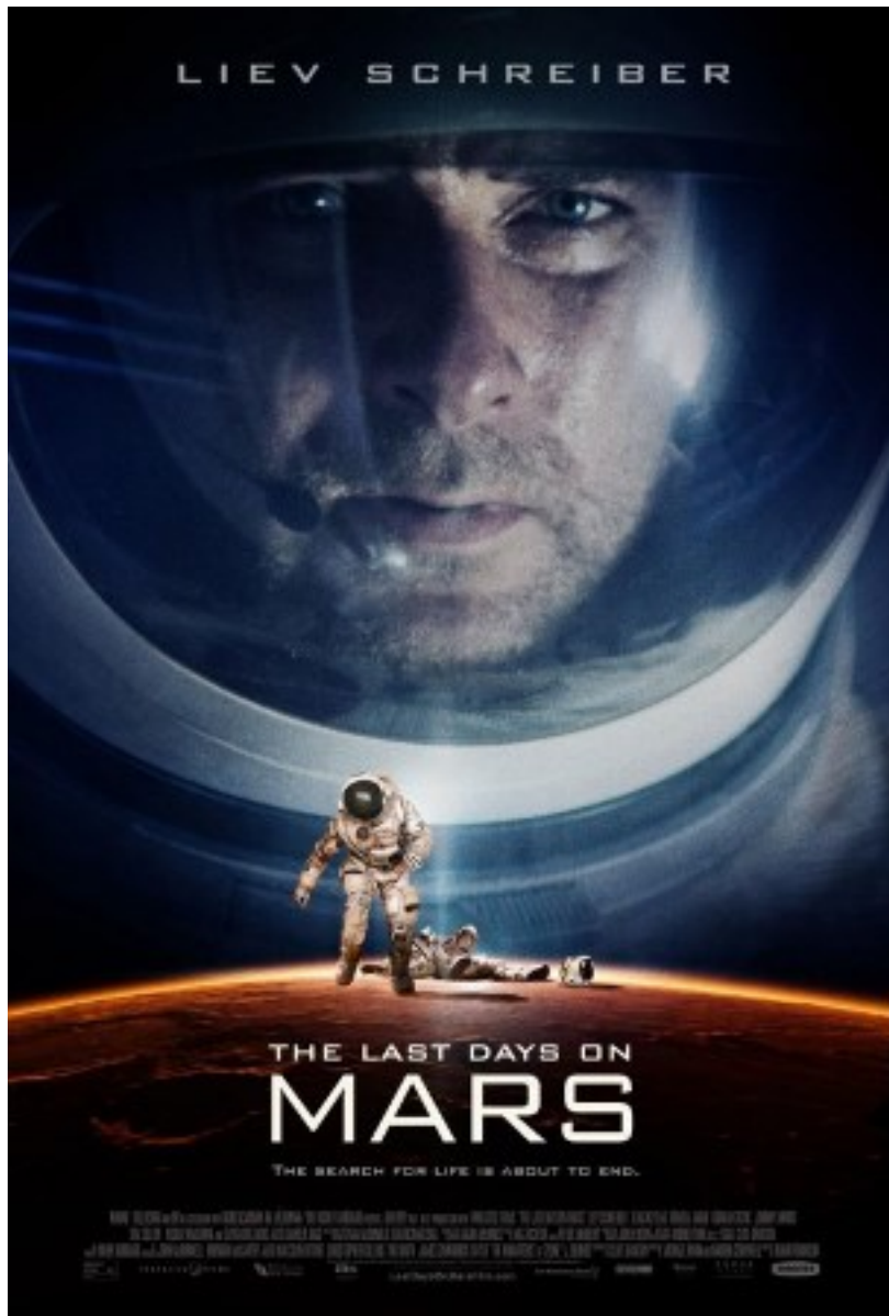
Last Days on Mars