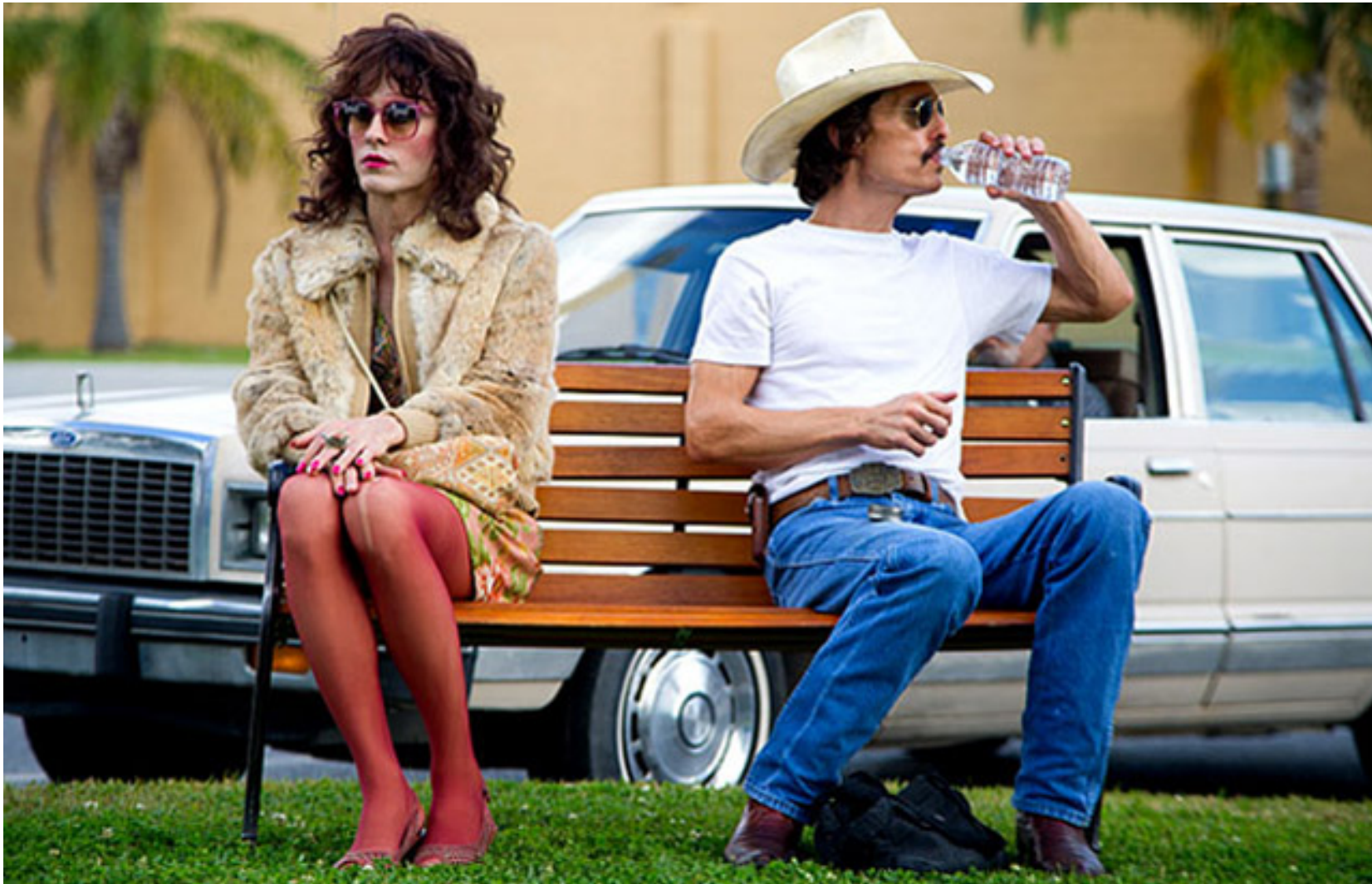
Taking On the System: Rayon (Jared Leto) and Ron (Matthew McConaughey) in 'Dallas Buyers Club'