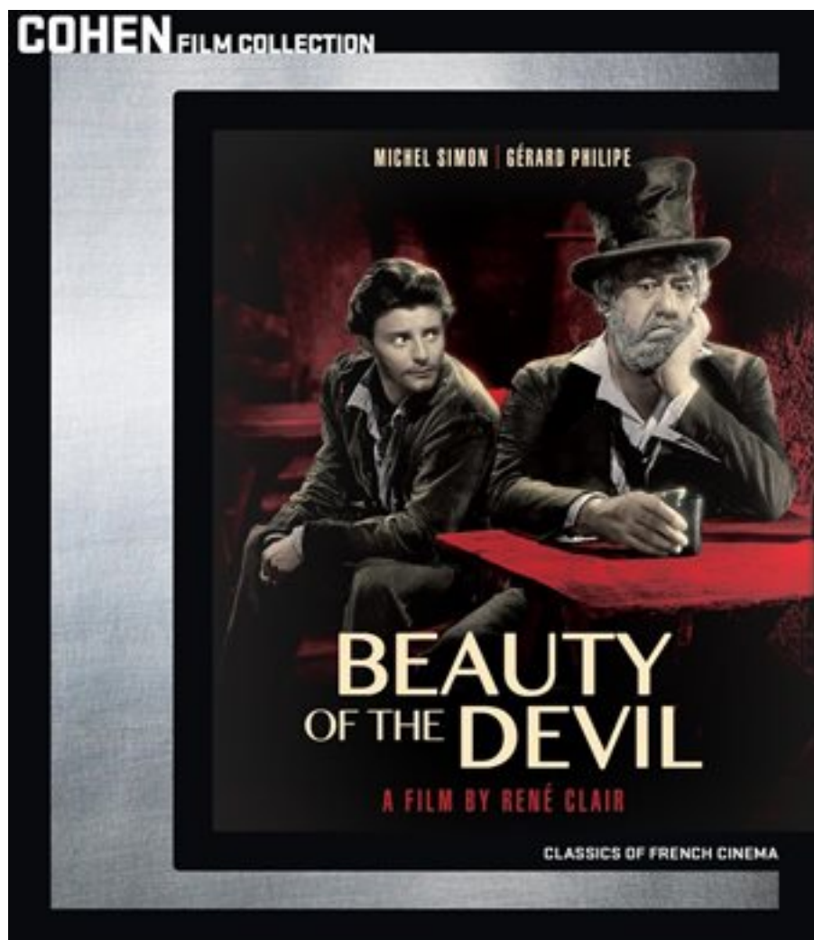
The Beauty of the Devil

Where to Watch: DVD, Vudu, Amazon Instant Streaming, iTunes, HBO Go