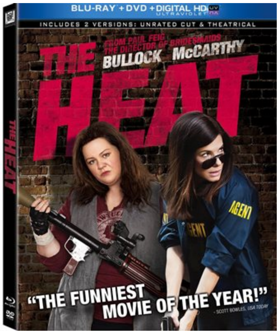
The Heat

CHICAGO – There are a few major comedies on New Releases shelves this week along with some interesting, smaller films and one of the most anticipated TV shows of 2013. What options are new in the world of Blu-ray, DVD, streaming and digital TV providers [29]? Some of the most interesting and most unbearable comedies of the year hit your home viewing radar. Here’s how to rank them from ha-ha to hateful.