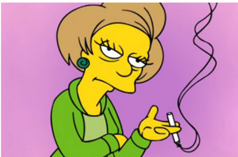
Edna Krabappel of 'The Simpsons'

She appeared off-Broadway and in an improv group called "The Fourth Wall." It was there she was discovered by a producer of "The Merv Griffin Show" (1962-86) – "It was a rainy night, and his casting guy just happened in," she told HollywoodChicago.com. "It was an incredible stroke of luck. He liked me that night, and called me in to meet Merv. And then 75 episodes later...I loved Merv and I loved everything about that show."