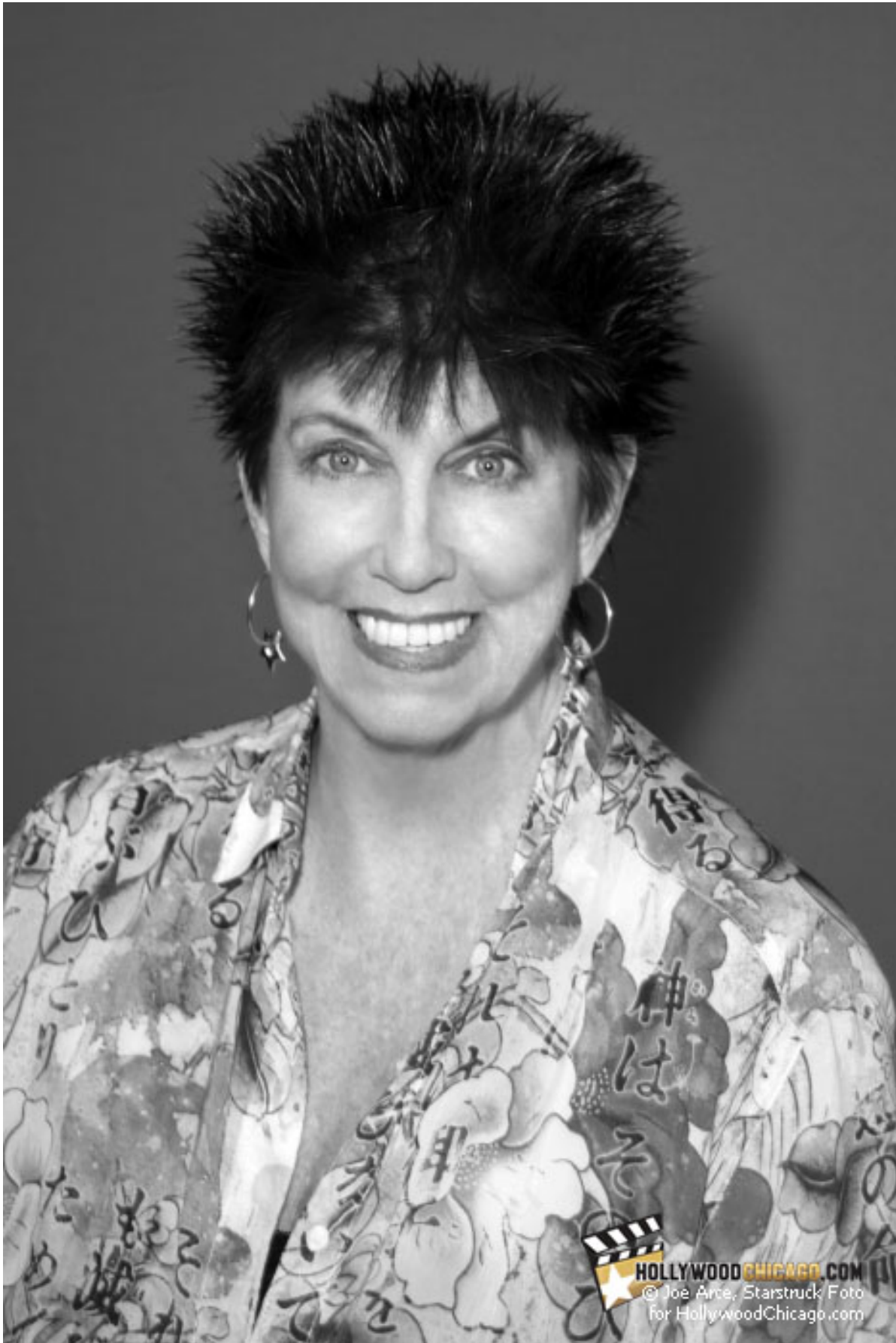
Marcia Wallace at the Hollywood Celebrities & Memorabilia Show in Chicago, 2010

"I had more guts than brains," she told HollywoodChicago.com in a 2010 interview. "I wanted to be a journalist, but my journalism teacher back home said, 'hon, you have no nose for news.' Go into drama. So I did. I took off to New York."