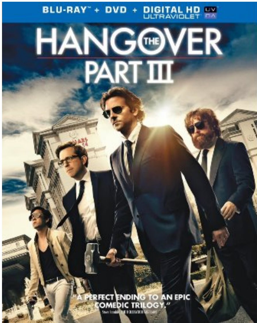
The Hangover, Part III