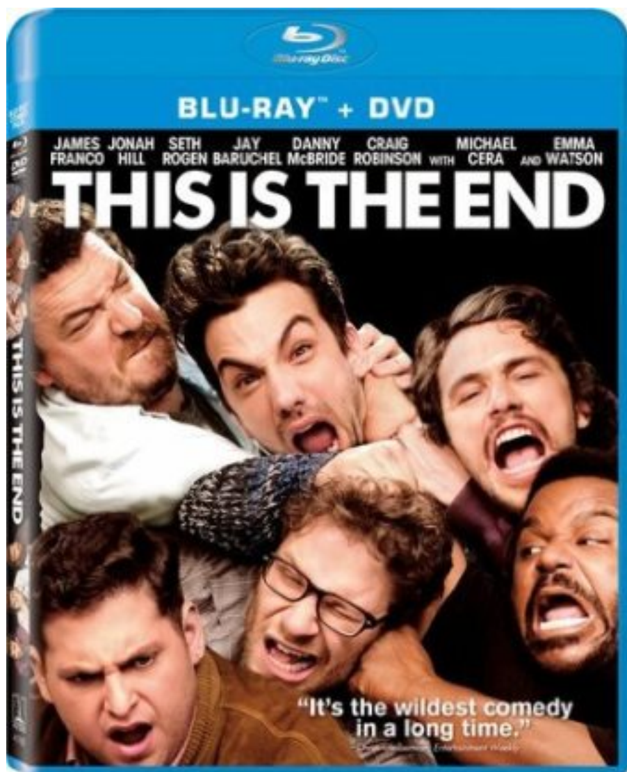
This is the End

We're back! Just in time to detail the most interesting Blu-ray, DVD, and streaming releases from the last week. Comedy, Shakespeare, Sci-fi, TV, and, of course, because it's October, horror. What will you find on New Releases shelves at your favorite store? What could you order on iTunes this week? What should you check out and what should you avoid? Here's your latest primer for What to Watch, in the order we think you should check 'em out.