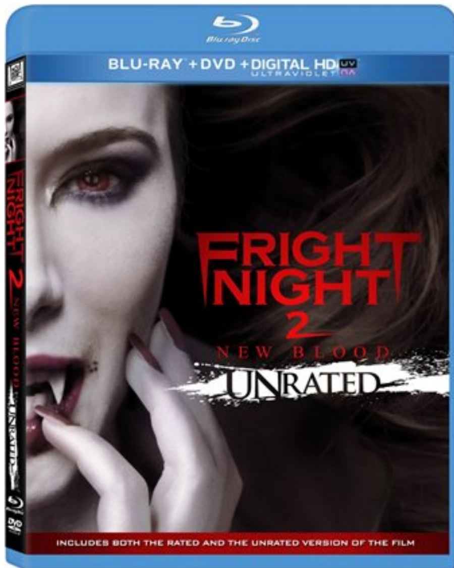
Fright Night, Part 2