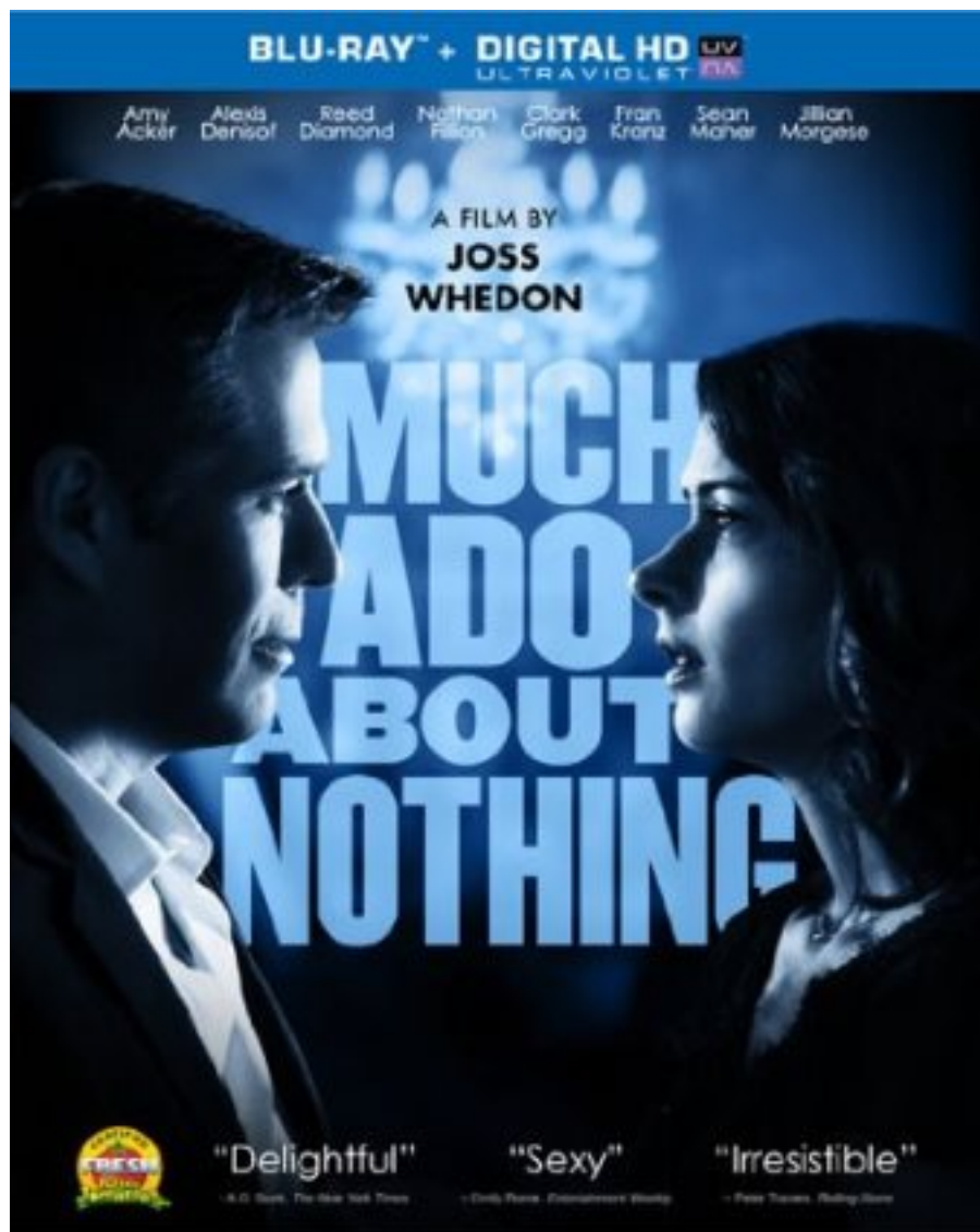
Much Ado About Nothing