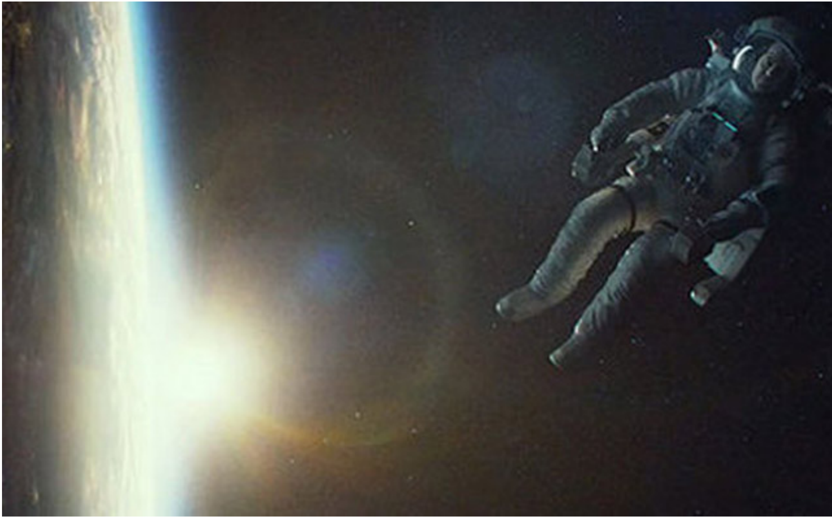
Floating, Drifting: Astronaut Matt Kowalski (George Clooney) in 'Gravity'