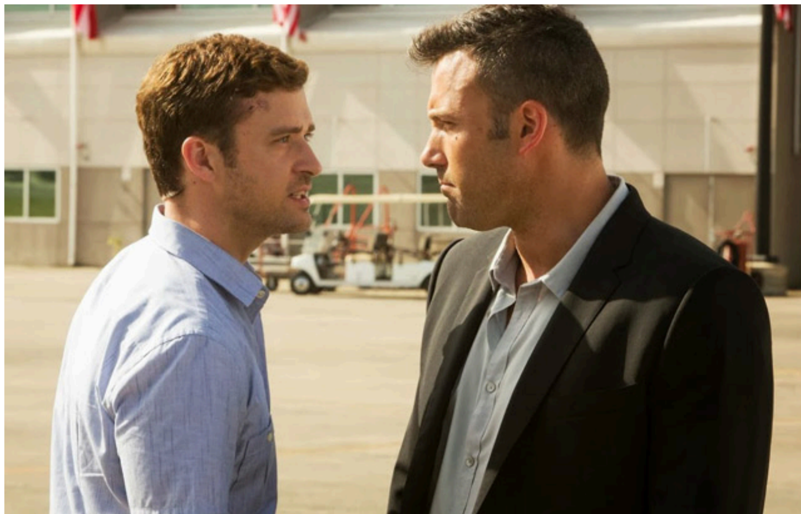
Richie (Justin Timberlake) Confronts Ivan (Ben Affleck) in 'Runner Runner'