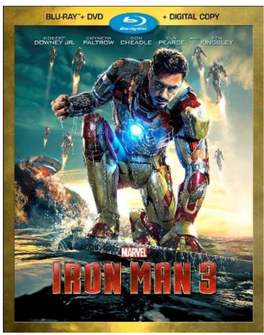
Iron Man 3

Where to Watch: Blu-ray, DVD, Netflix, Amazon Instant Streaming, iTunes