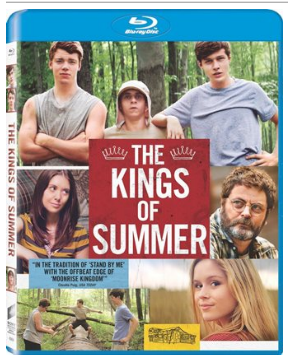
The Kings of Summer

Published on HollywoodChicago.com (http://www.hollywoodchicago.com)