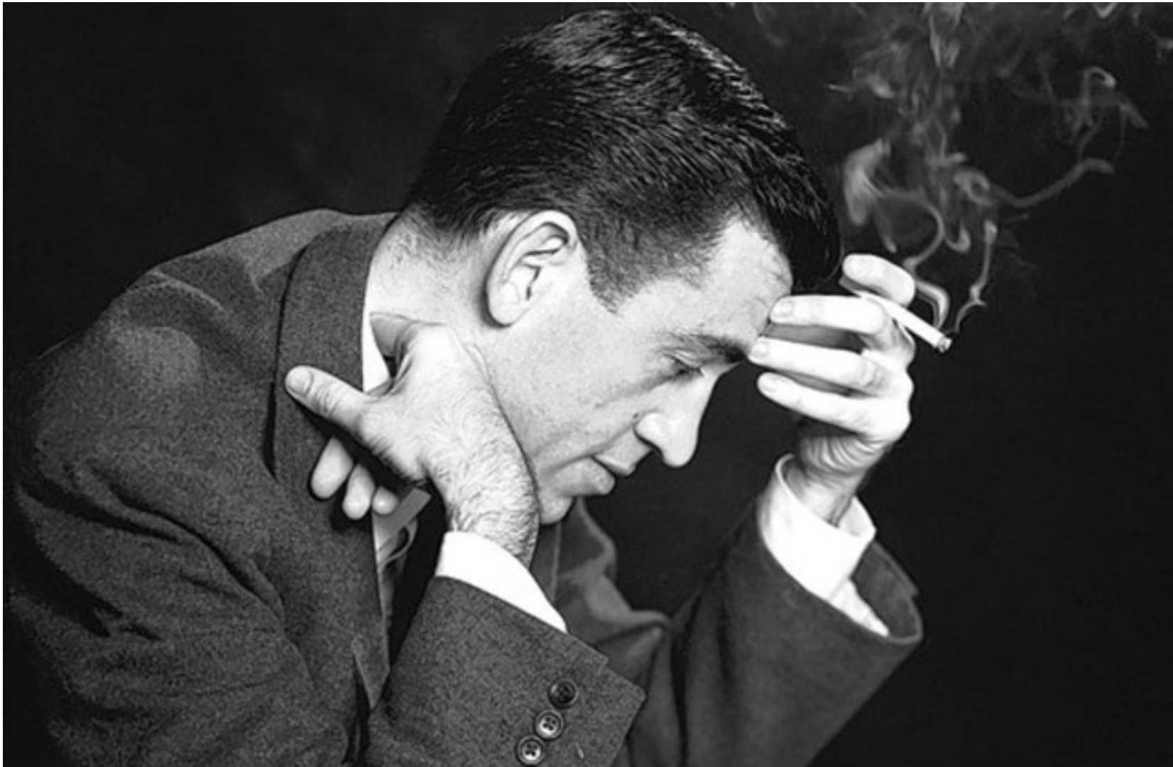
The Agony, Ecstasy and Nicotine: The Author in an Early Publicity Portrait in ‘Salinger’