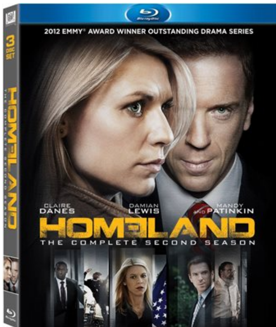
Homeland: The Complete Second Season