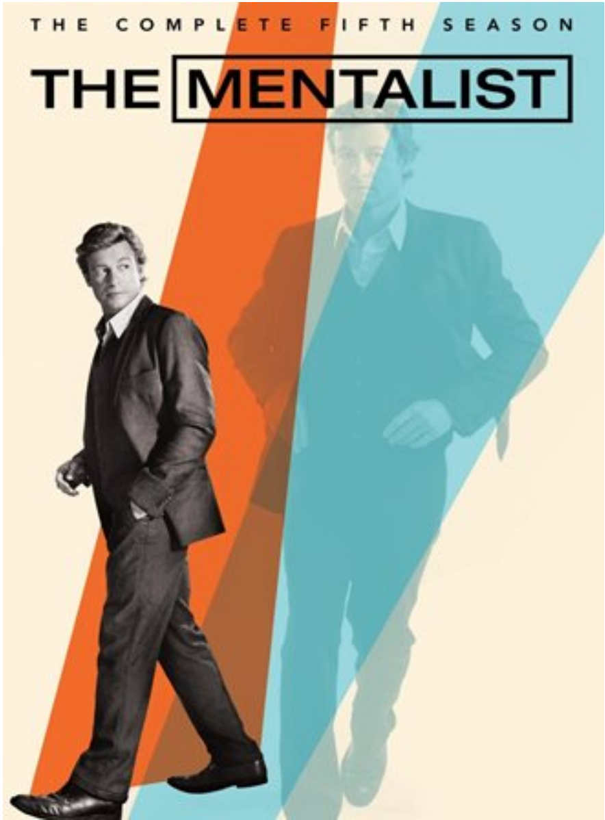
The Mentalist: Season Five

I used to dig “The Mentalist” but the writers got too lazy around season three and even star Simon Baker seemed uninterested in his own character to the degree that he often lost his accent. It’s become a modest procedural, a show that never quite lived up to its potential. However, if you disagree and remain a bigger fan than me, you probably want to keep up with Patrick Jane & Red John. You can do so now on DVD.