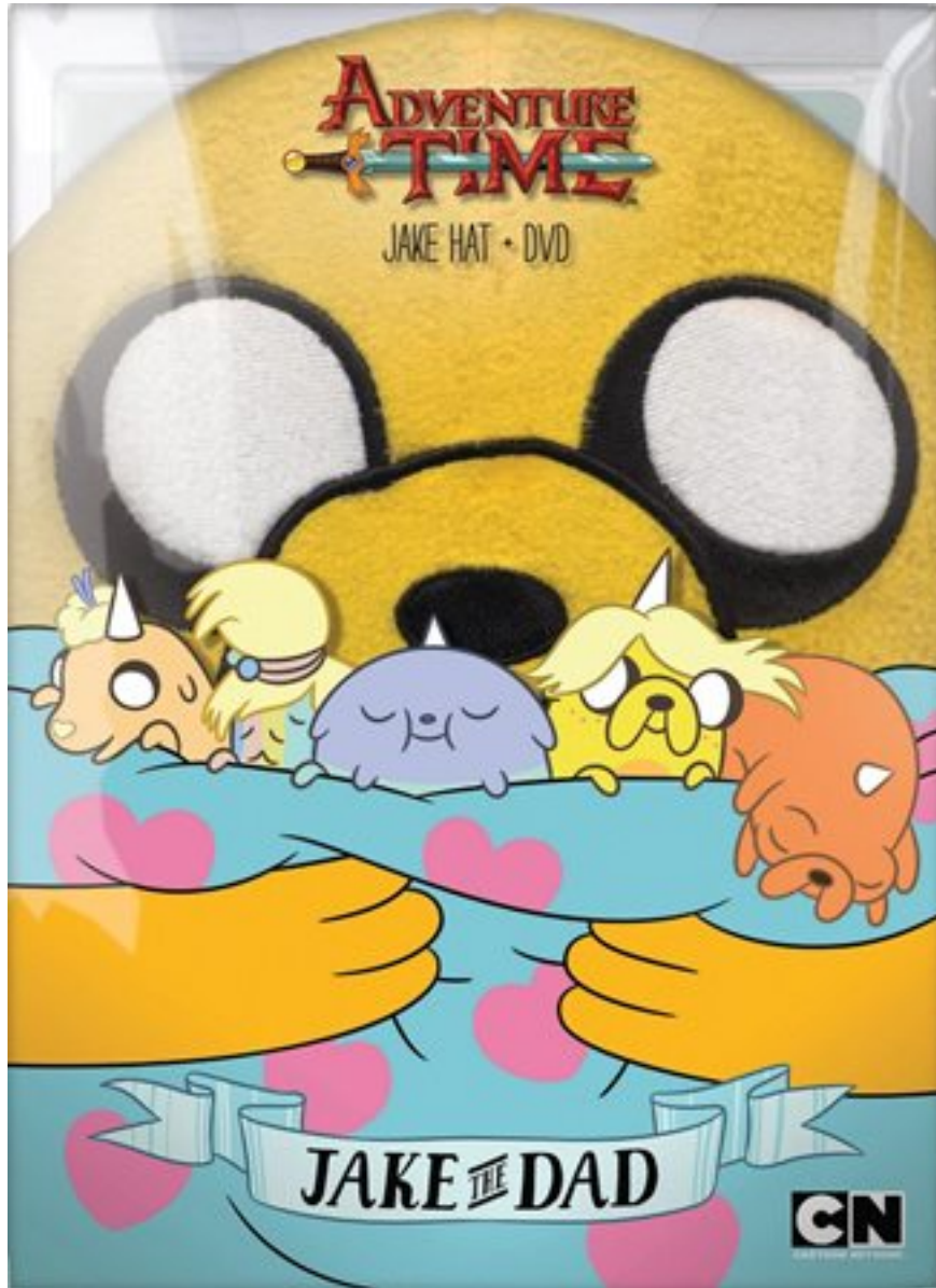
Adventure Time: Jake the Dad