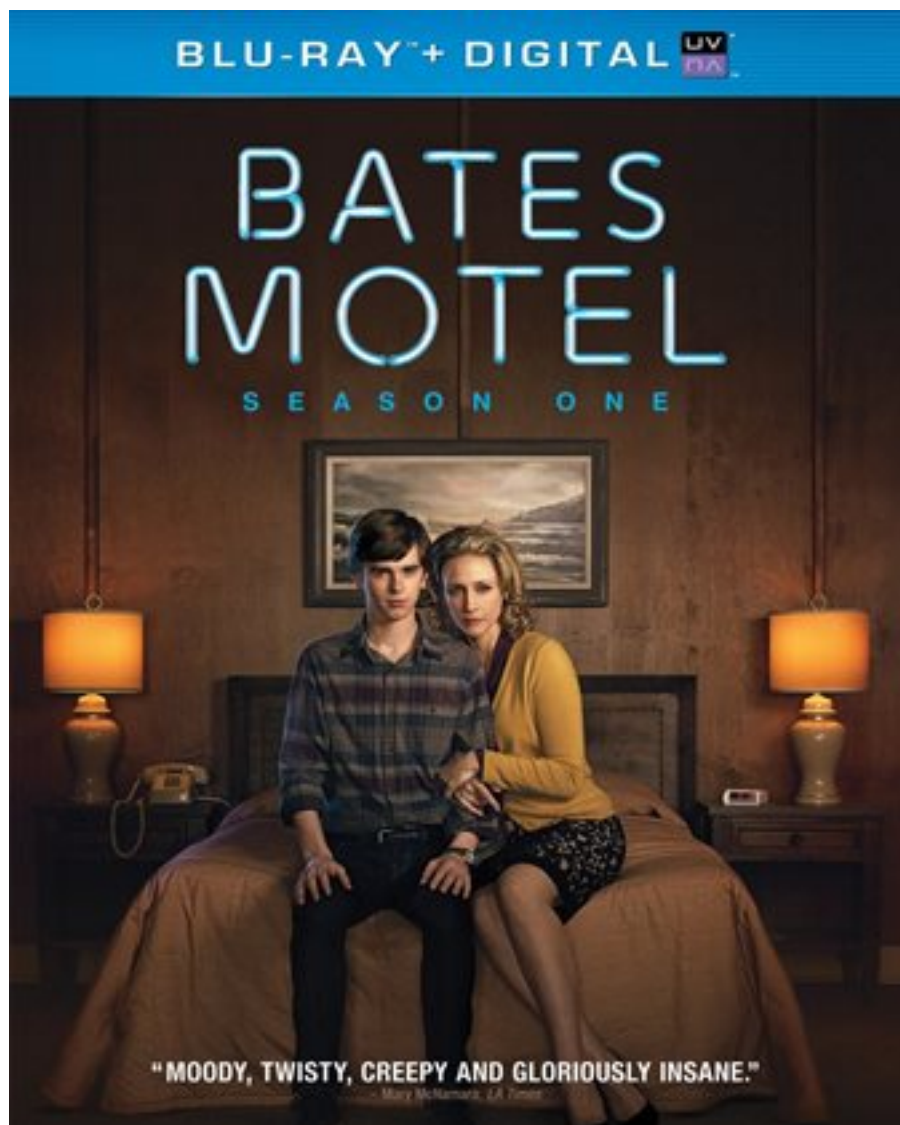
Bates Motel: Season One