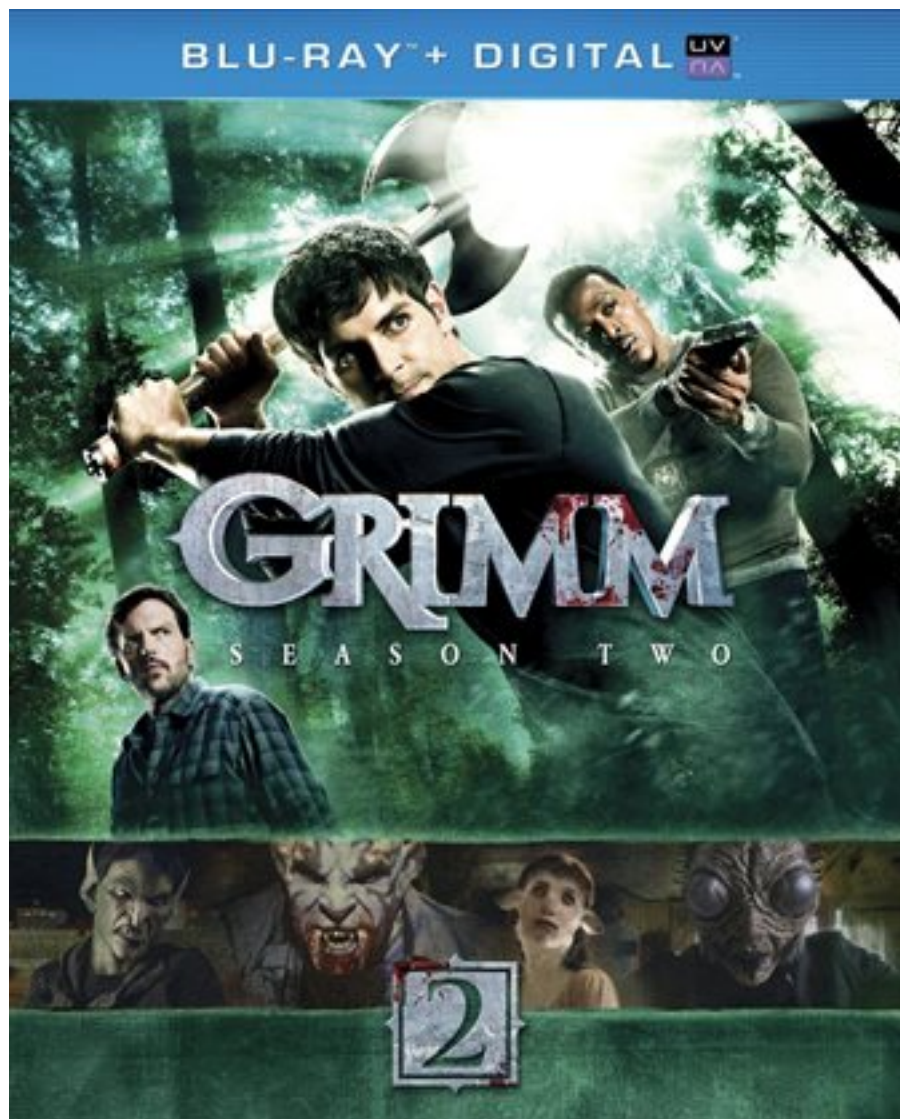
Grimm: Season Two