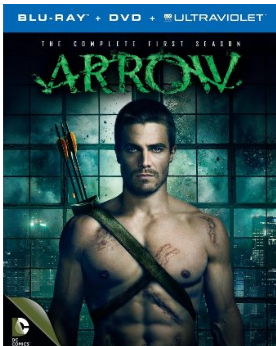
Arrow: The Complete First Season