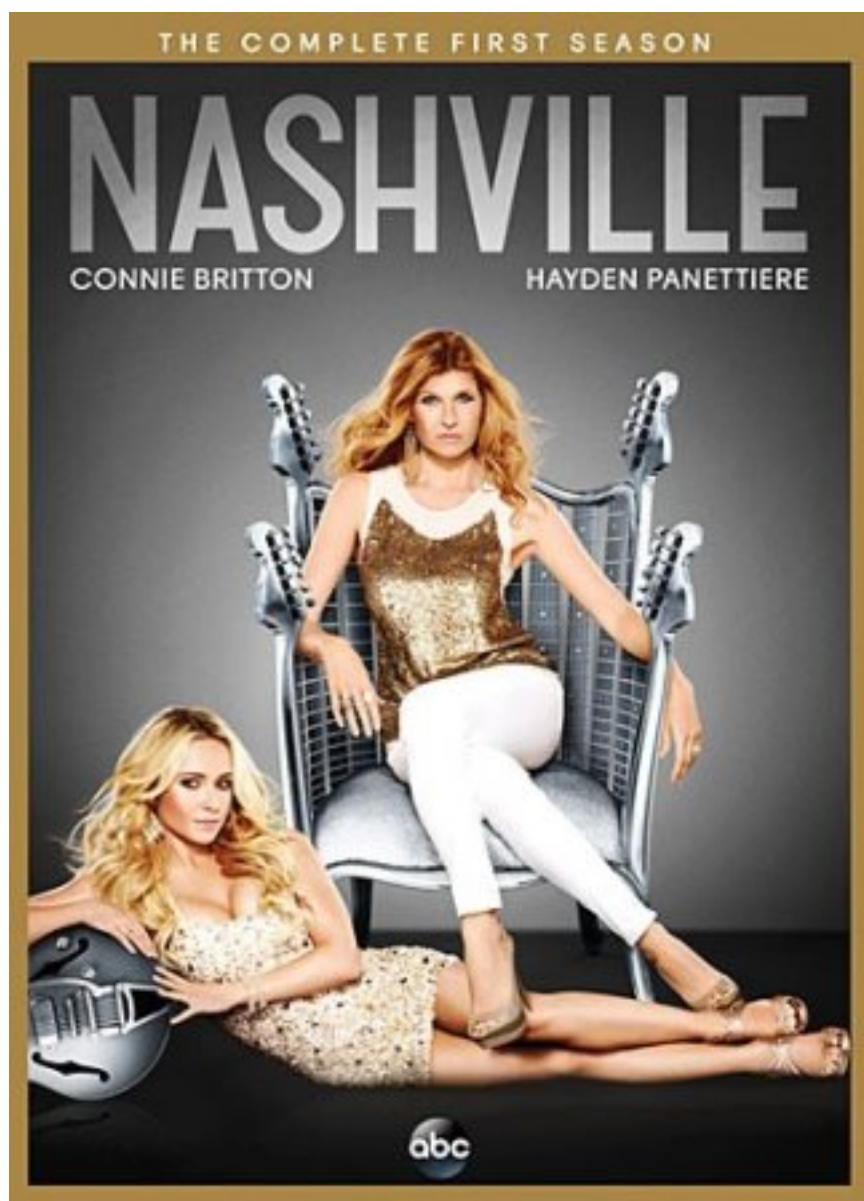
Nashville: The Complete First Season