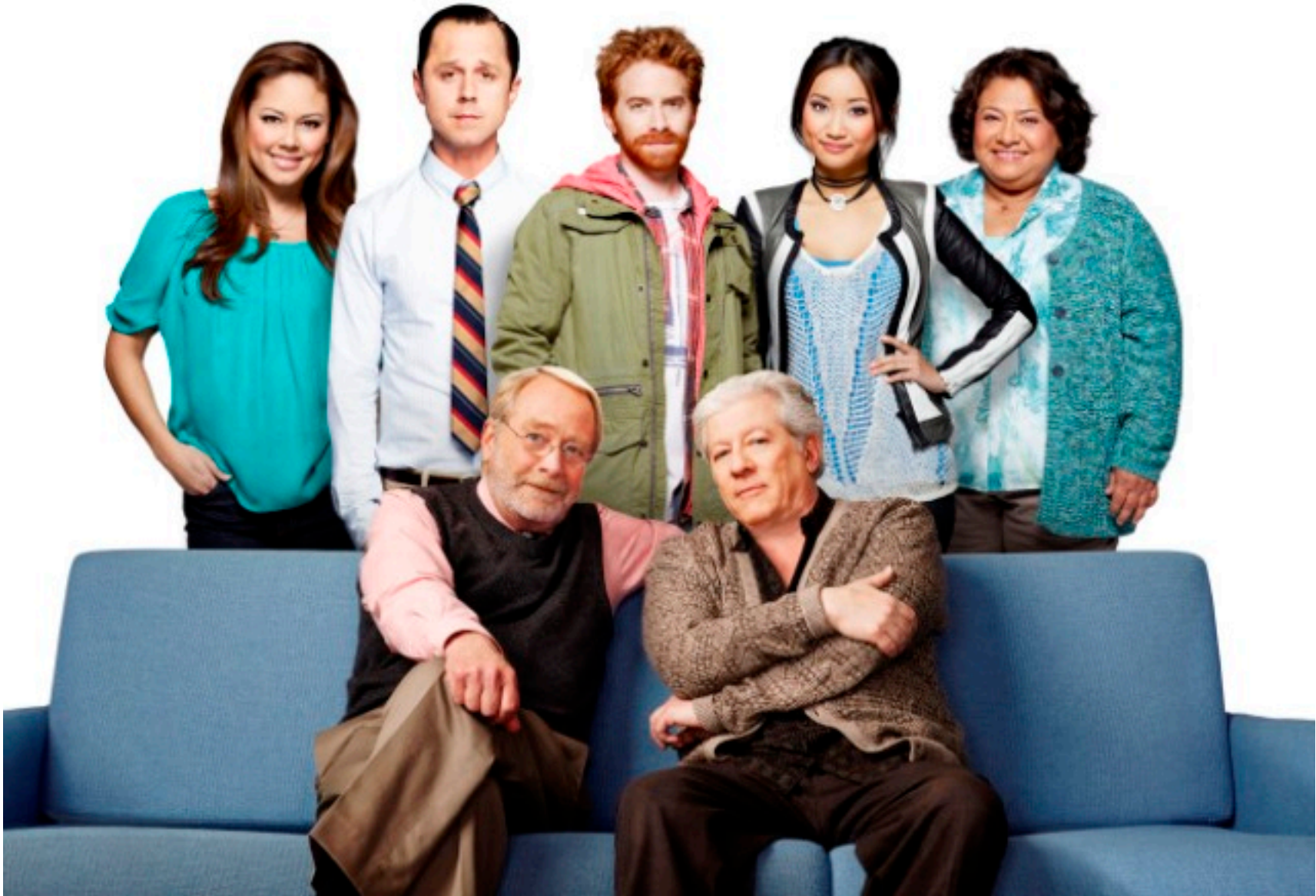
Dads

What Eli and Warner have in common more than their business interest is that they both have dads who won't go away. Eli's pop David (Peter Riegert) simply doesn't support him in any way, as he criticizes his entire life while messing up his own. Unsupportive fathers! Hysterical! Warner's dad Crawford (Martin Mull) is the more schlubby of the two, thinking that he's helping his son in the business world but not realizing that he's passed him by. Meddling fathers! Hilarious!