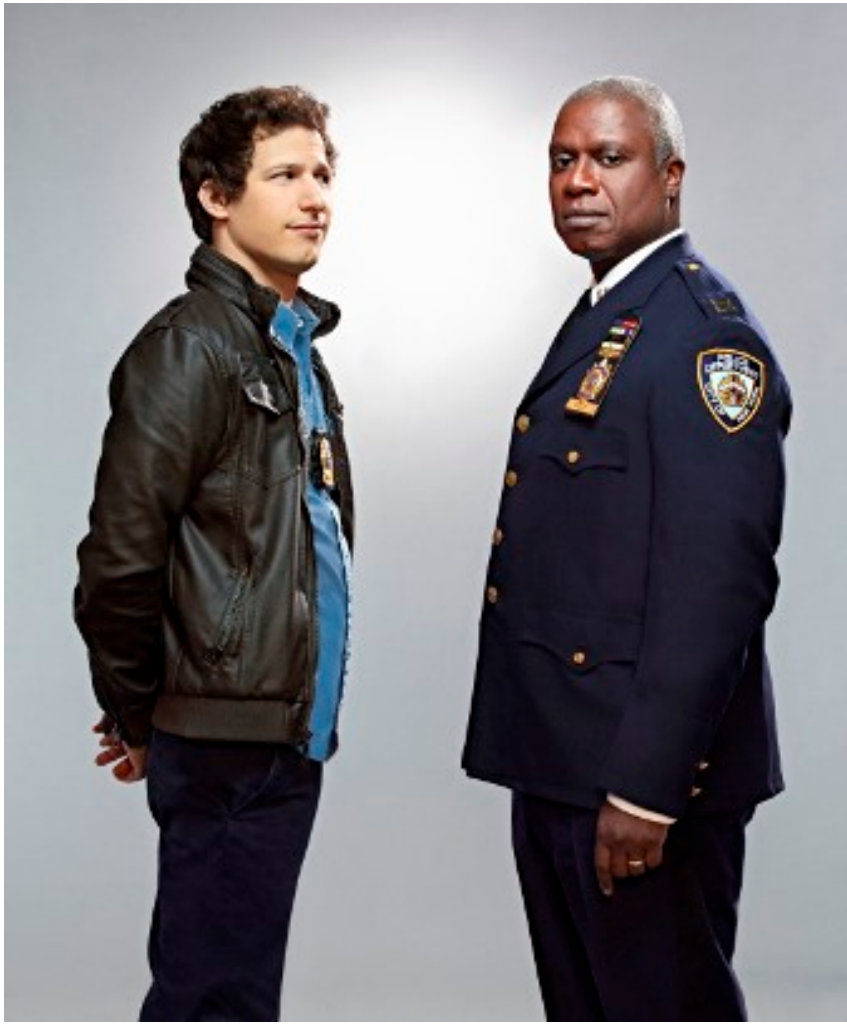
Brooklyn Nine-Nine

Jake immediately butts heads with his new, by-the-book captain, Ray Holt (the great Andre Braugher). Holt orders him to wear a tie around the station and follow procedure. The oil-and-water dynamic feels a little overplayed in the premiere but will surely settle into something more organic. The two VERY different performance styles by Samberg & Braugher make them a unique comedy duo in a landscape that could have used more originality in its new sitcom offerings. And it helps that the supporting cast is uniformly strong, including Melissa Fumero as the Peralta's closest competition in terms of total arrests, the funny Terry Crews as the Sergeant now afraid to do anything dangerous because he just had baby girls, Joe Lo Truglio as the awkward guy with his heart in the right place, and Stephanie Beatriz as the toughest female cop in town.