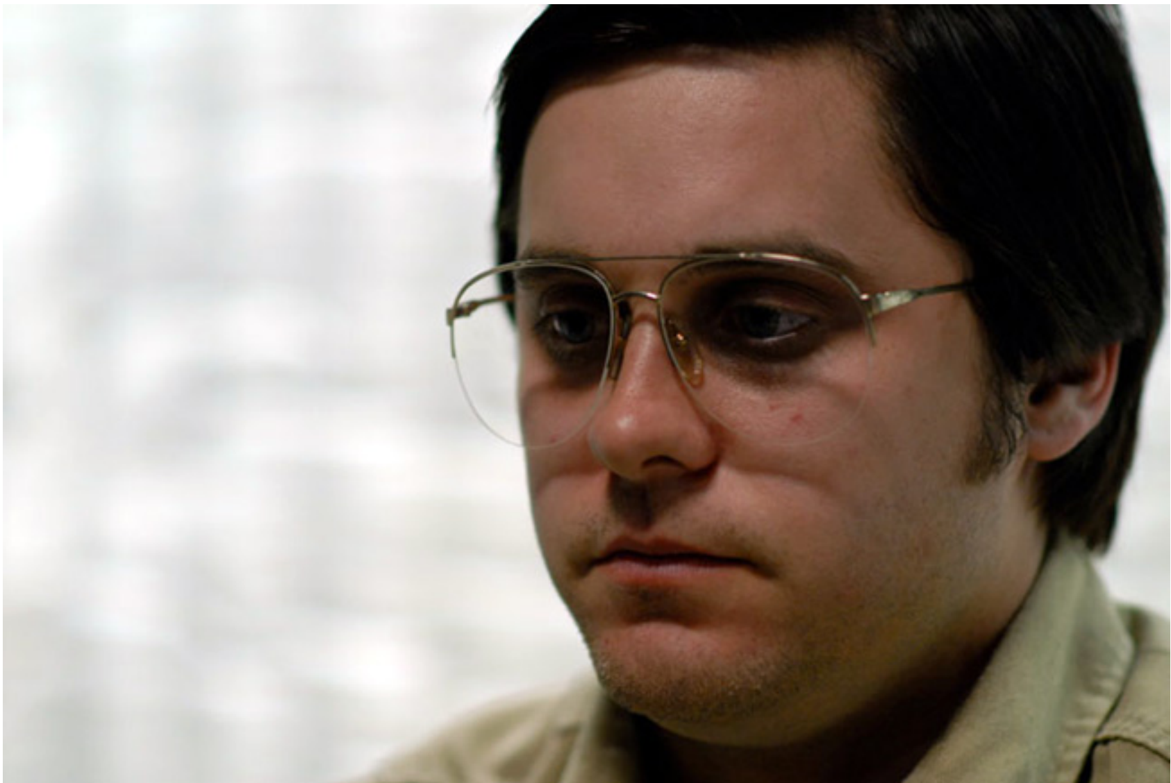
Jared Leto in “Chapter 27”.