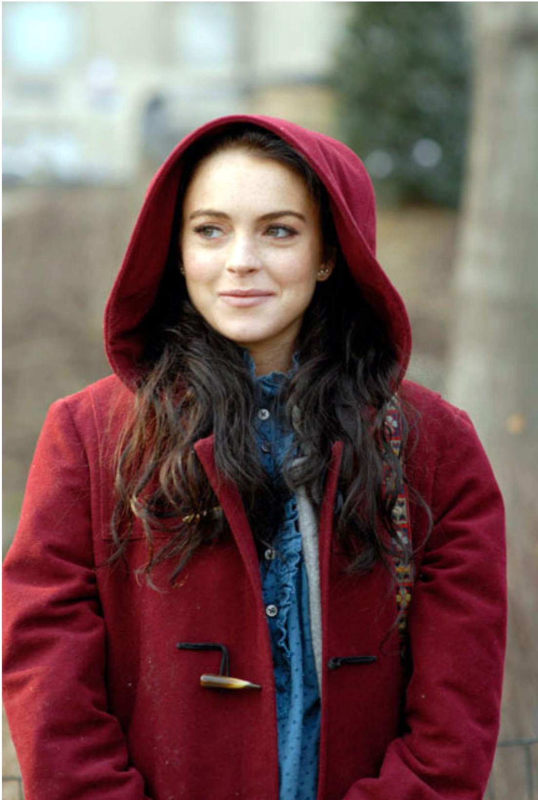
Lindsay Lohan in “Chapter 27”.