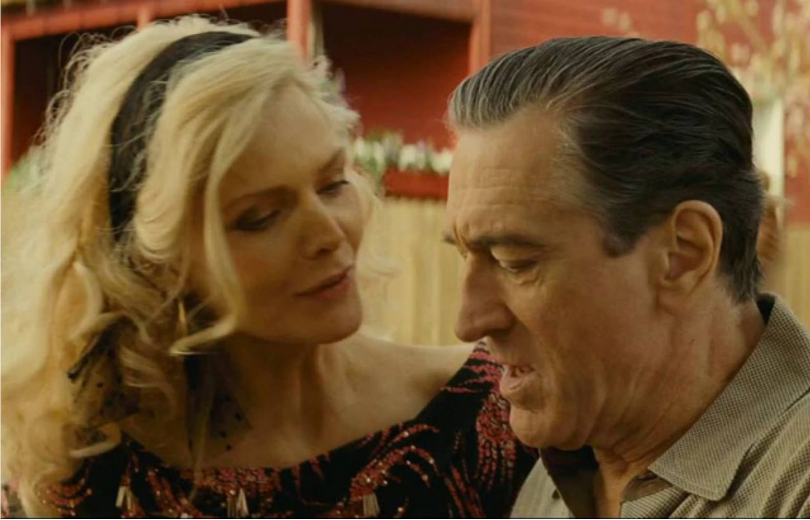
Flashback: Giovanni (Robert De Niro) and Maggie (Michelle Pfeiffer) During Better Days in 'The Family'