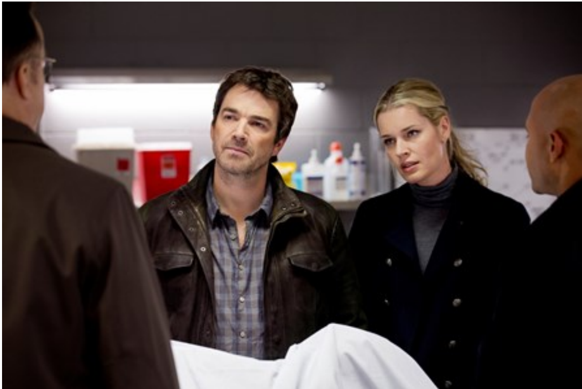
King and Maxwell

With the world abuzz about government programs like the NSA surveillance issue, the timing seems perfect for a mystery series about a pair who will work for the little man or try to protect someone in office. They work outside of the industry but know how it ticks better than those still within it.