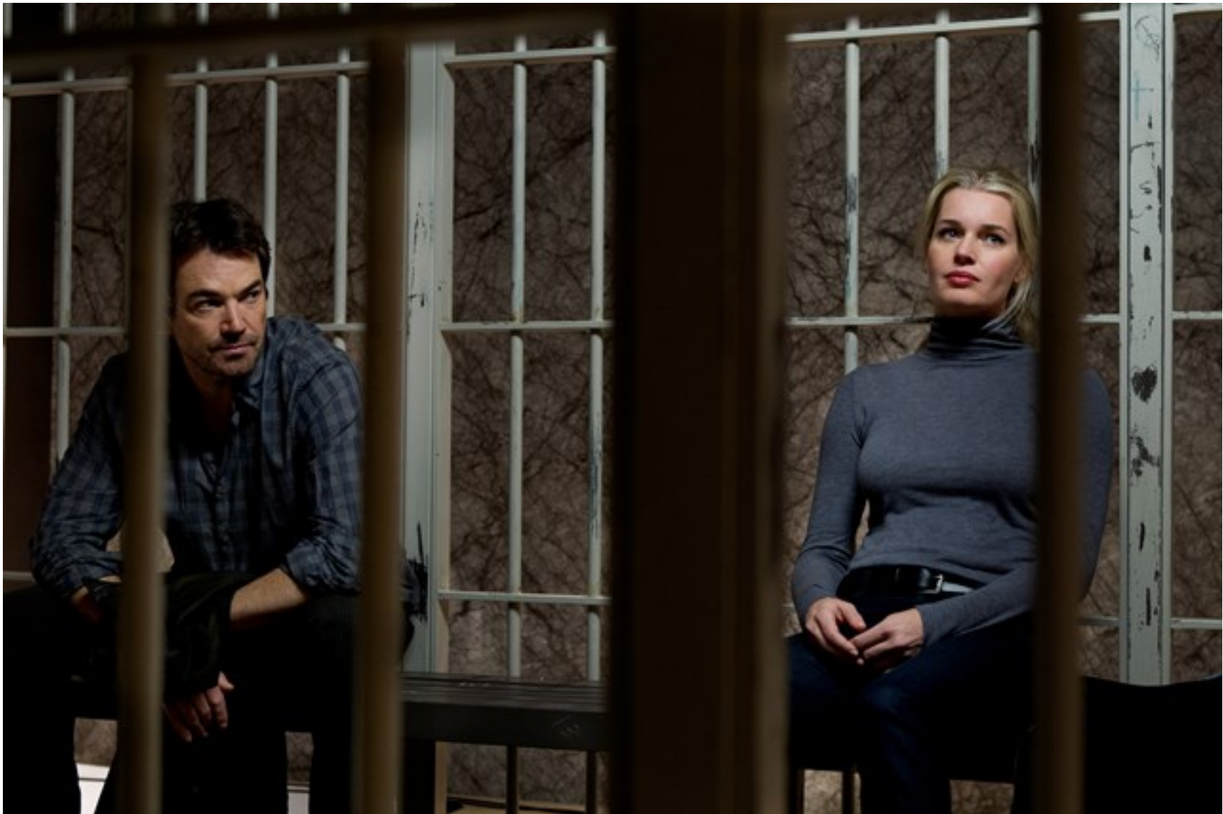
King and Maxwell