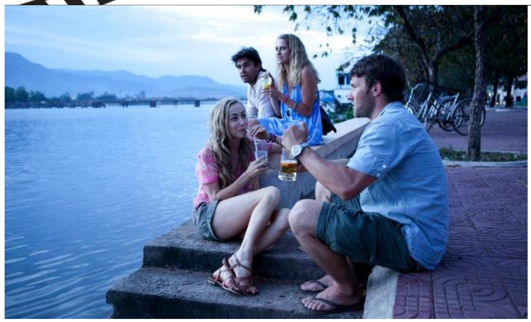
Wish You Were Here

Published on HollywoodChicago.com (http://www.hollywoodchicago.com)