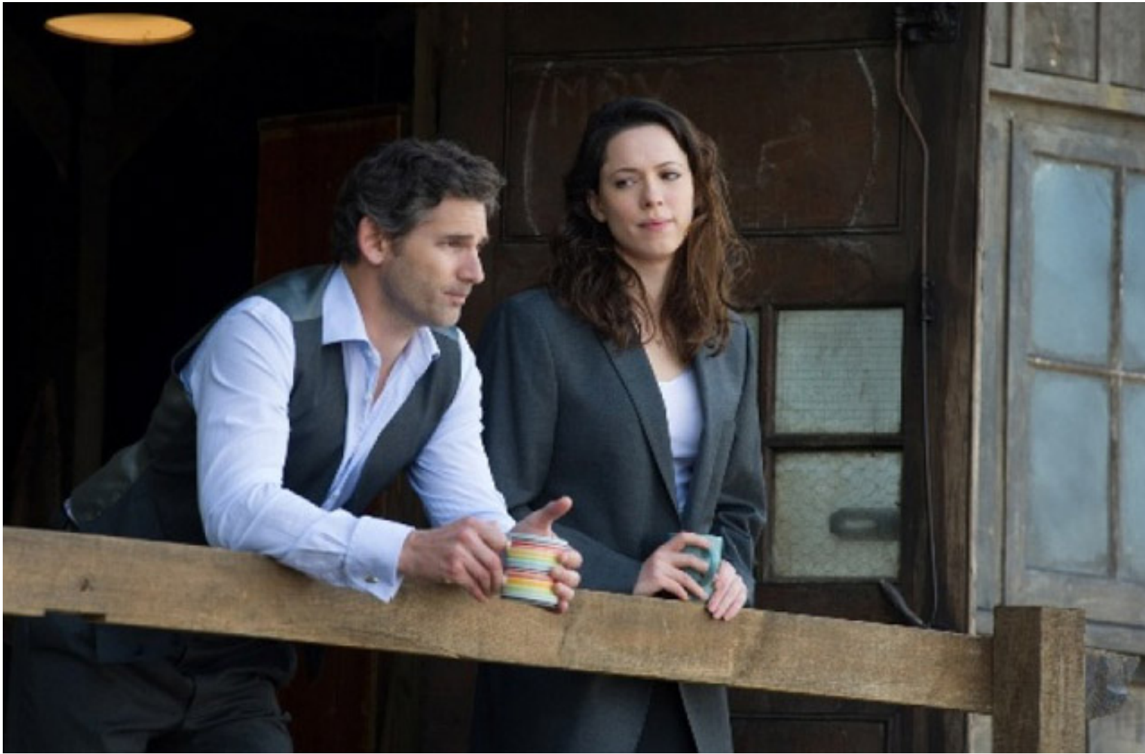
Martin (Eric Bana) and Claudia (Rebecca Hall) Under Scrutiny in 'Closed Circuit'