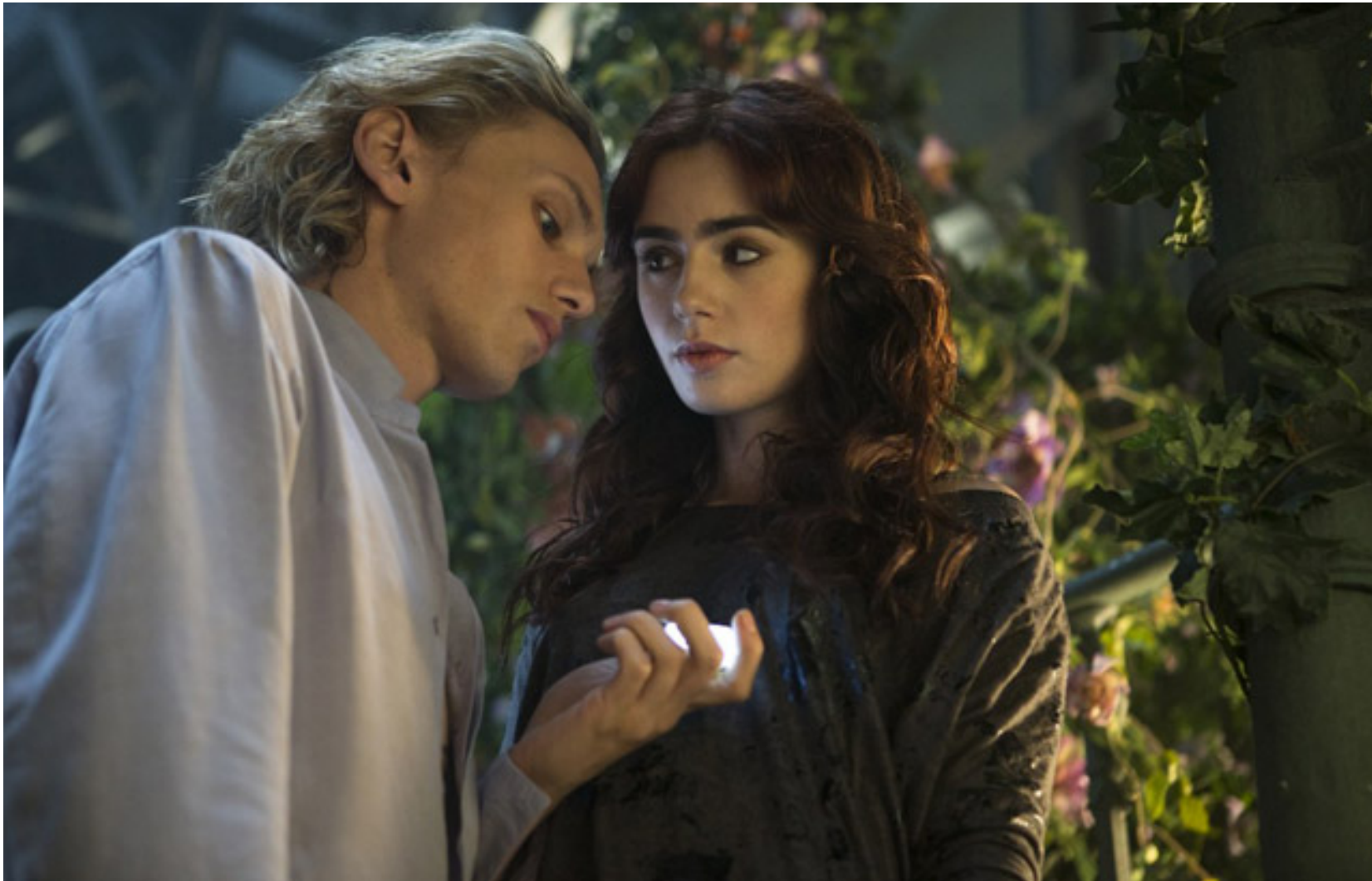
Jace (Jamie Campbell Bower) and (Clary) Lily Collins in ‘The Mortal Instruments: City of Bones’