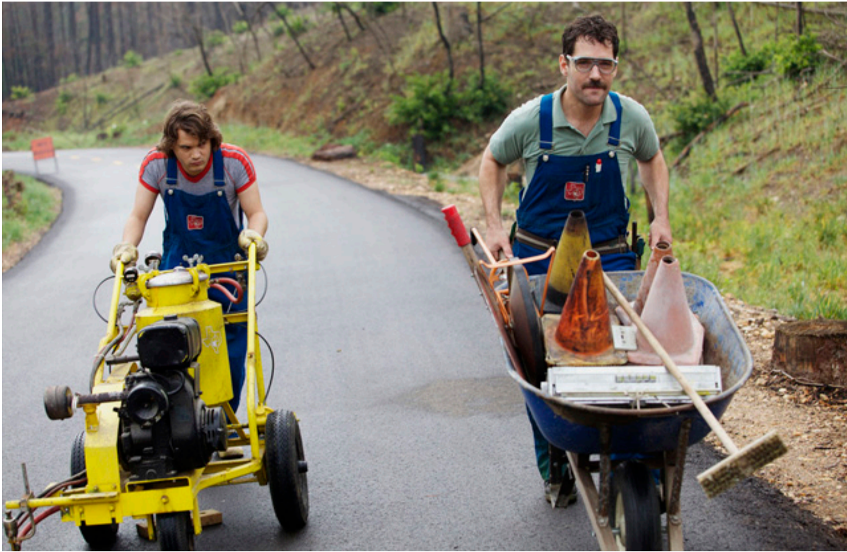
Lance (Emile Hirsch) and Alvin (Paul Rudd) are Highwaymen in 'Prince Avalanche'