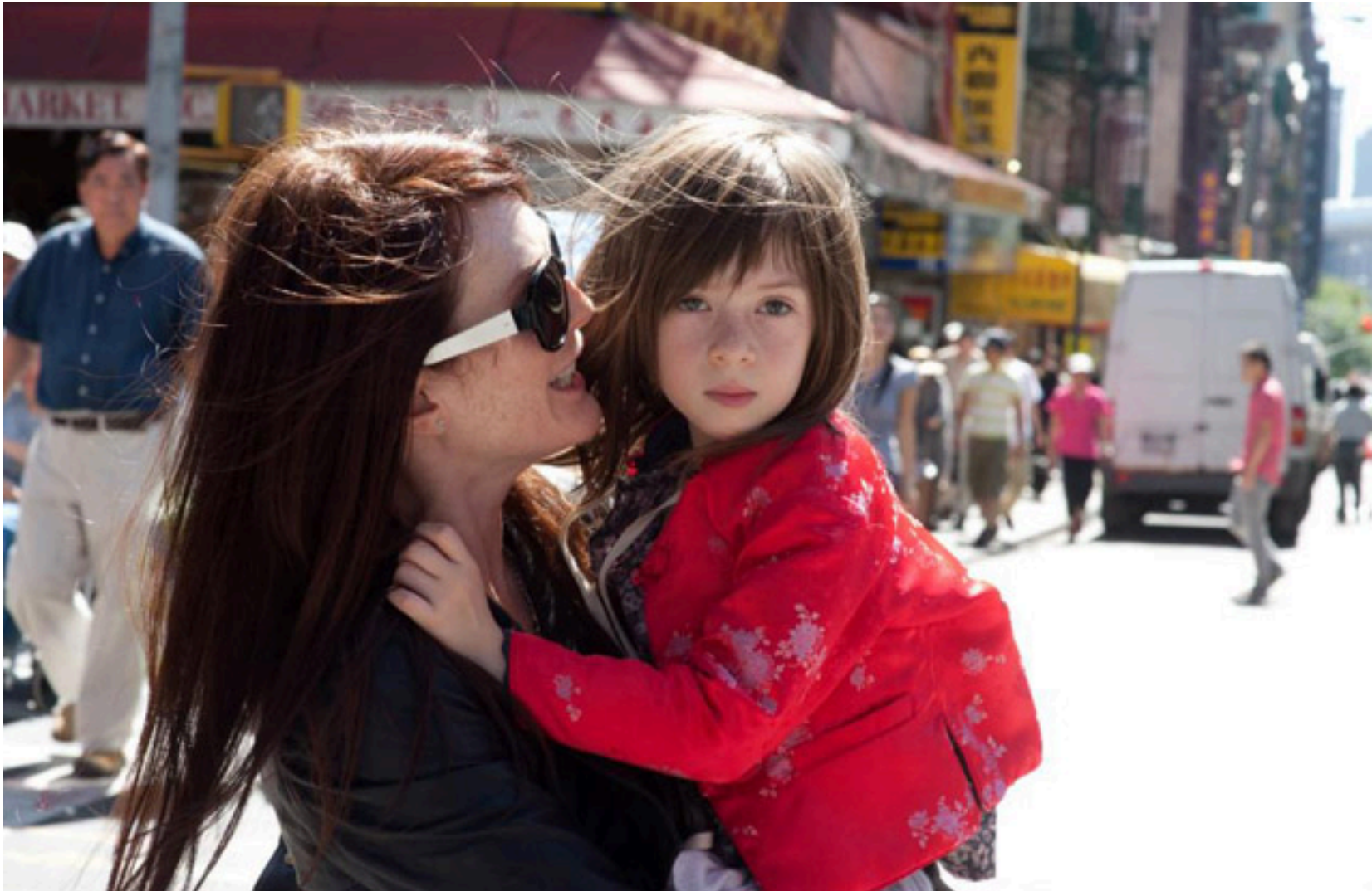
Susanna (Julianne Moore) and Maisie (Onata Aprile) in ‘What Maisie Knew’