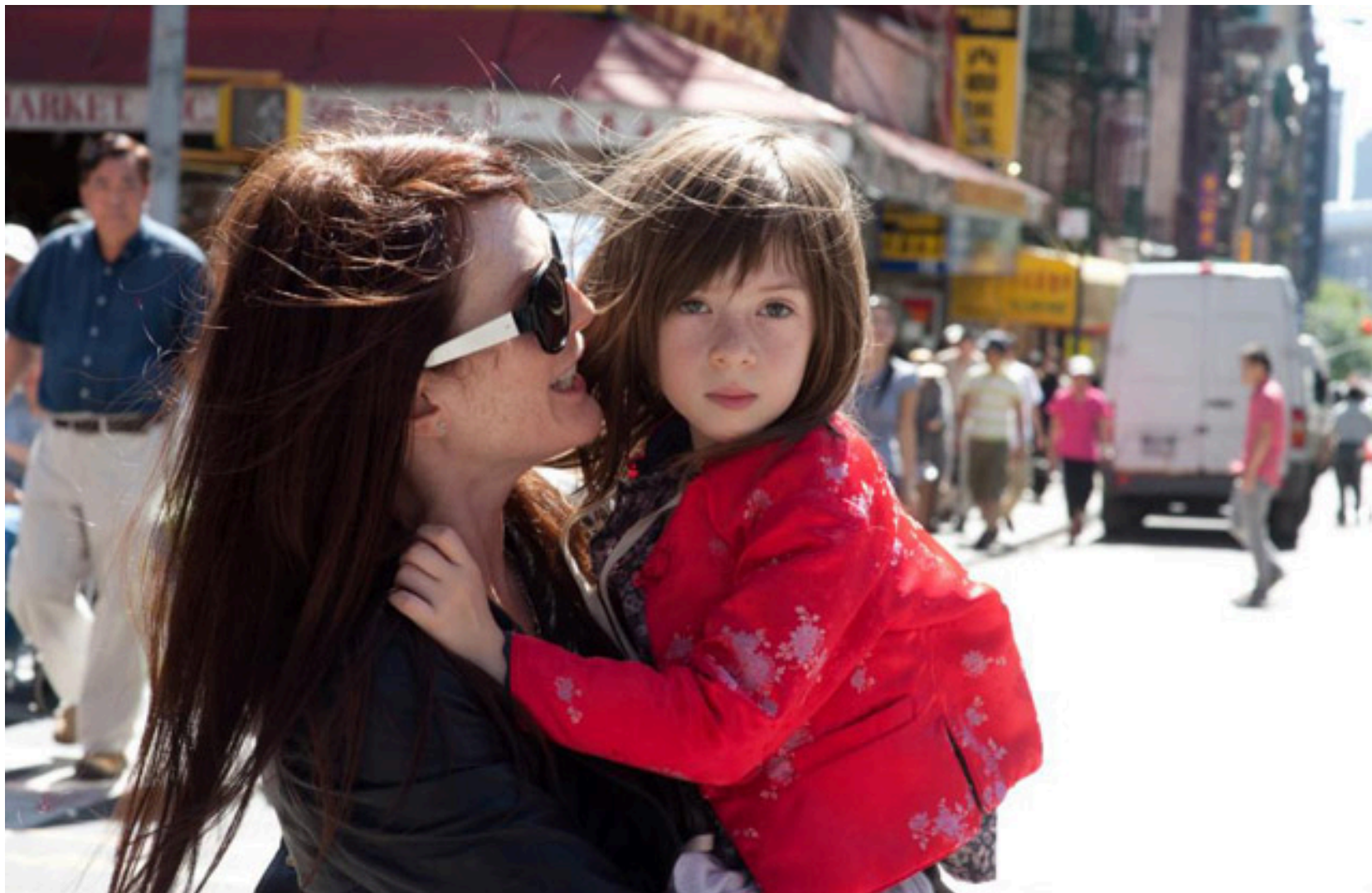
Susanna (Julianne Moore) and Maisie (Onata Aprile) in ‘What Maisie Knew’