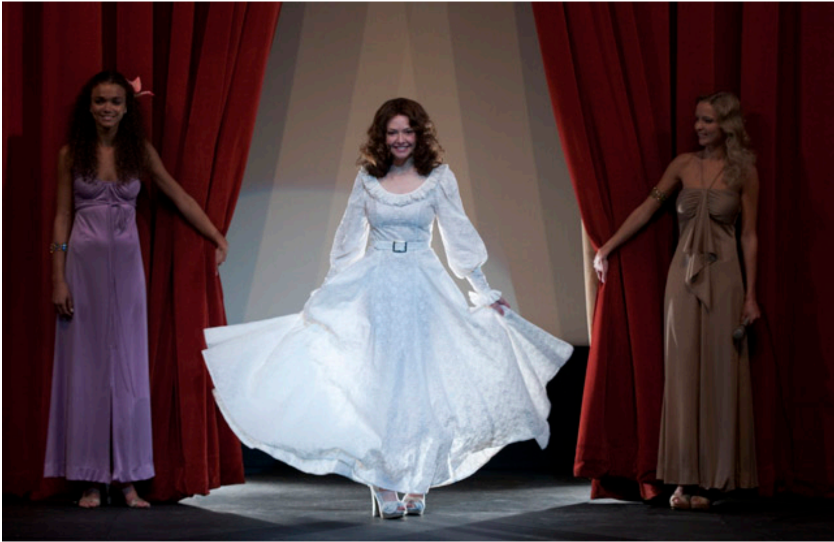
Linda Lovelace (Amanda Seyfried) Makes Her Debut in 'Lovelace'