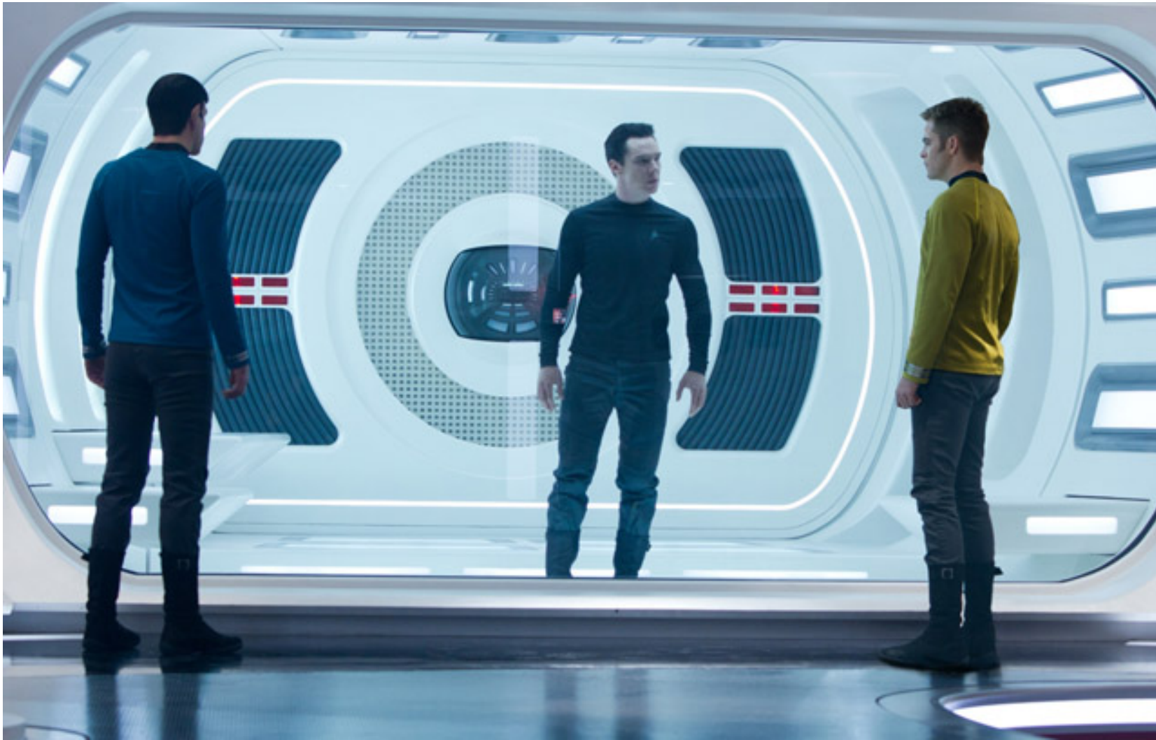
Spock (Zachary Quinto), Khan (Benedict Cumberbatch) and Kirk (Chris Pine) in ‘Star Trek Into Darkness’