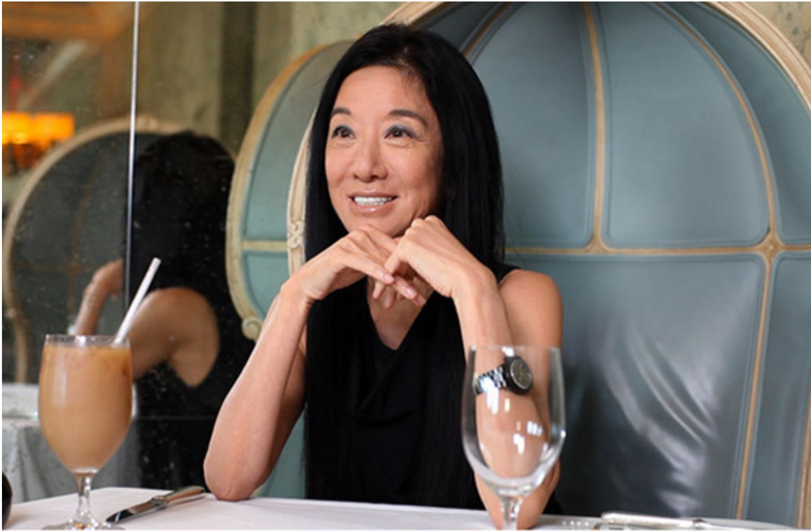
Designer Vera Wang Praises the Fortune-ator in ‘Scatter my Ashes at Bergdorf’s’