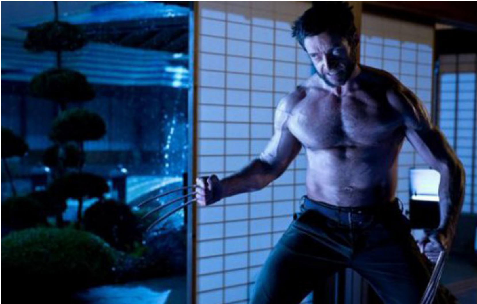
Logan (Hugh Jackman) Goes to Japan in ‘The Wolverine’

★ Continue reading for Patrick McDonald’s full review of “The Wolverine” [16]