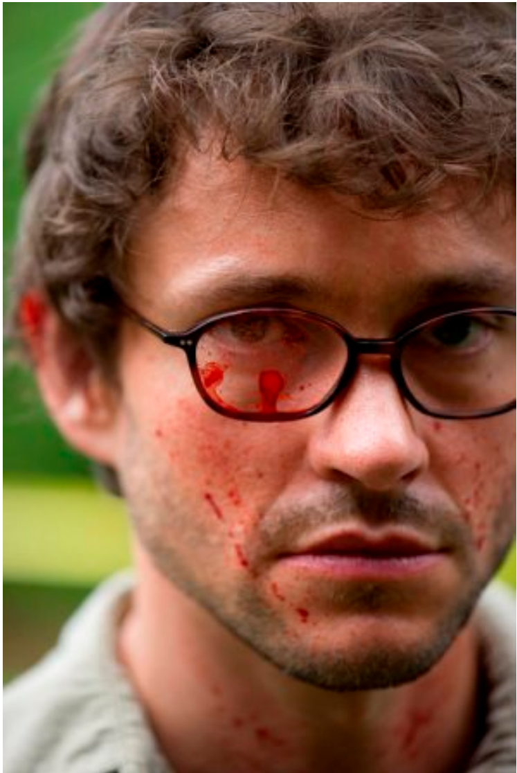
Hannibal

Hold on. We're getting ahead. As expected, NBC already renewed reliable performers "Grimm," "Parenthood," and "Law & Order: SVU," while also giving "Revolution" and "Chicago Fire" second chances to find bigger audiences.