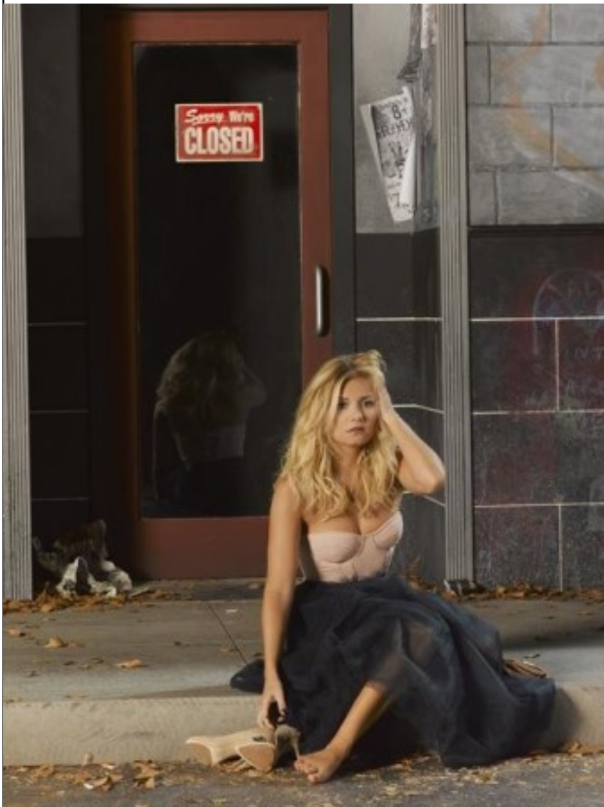
Happy Endings

Another factor in common with last year is that ABC seems likely to say goodbye to a critically-liked comedy with a loyal fanbase that I expect to end up on cable. USA has been in talks to take “Happy Endings” off ABC’s hands and they’ll gladly let them do so. The show that ABC never really supported, moved numerous times and put in different timeslots, is not going to be on the network’s fall schedule.