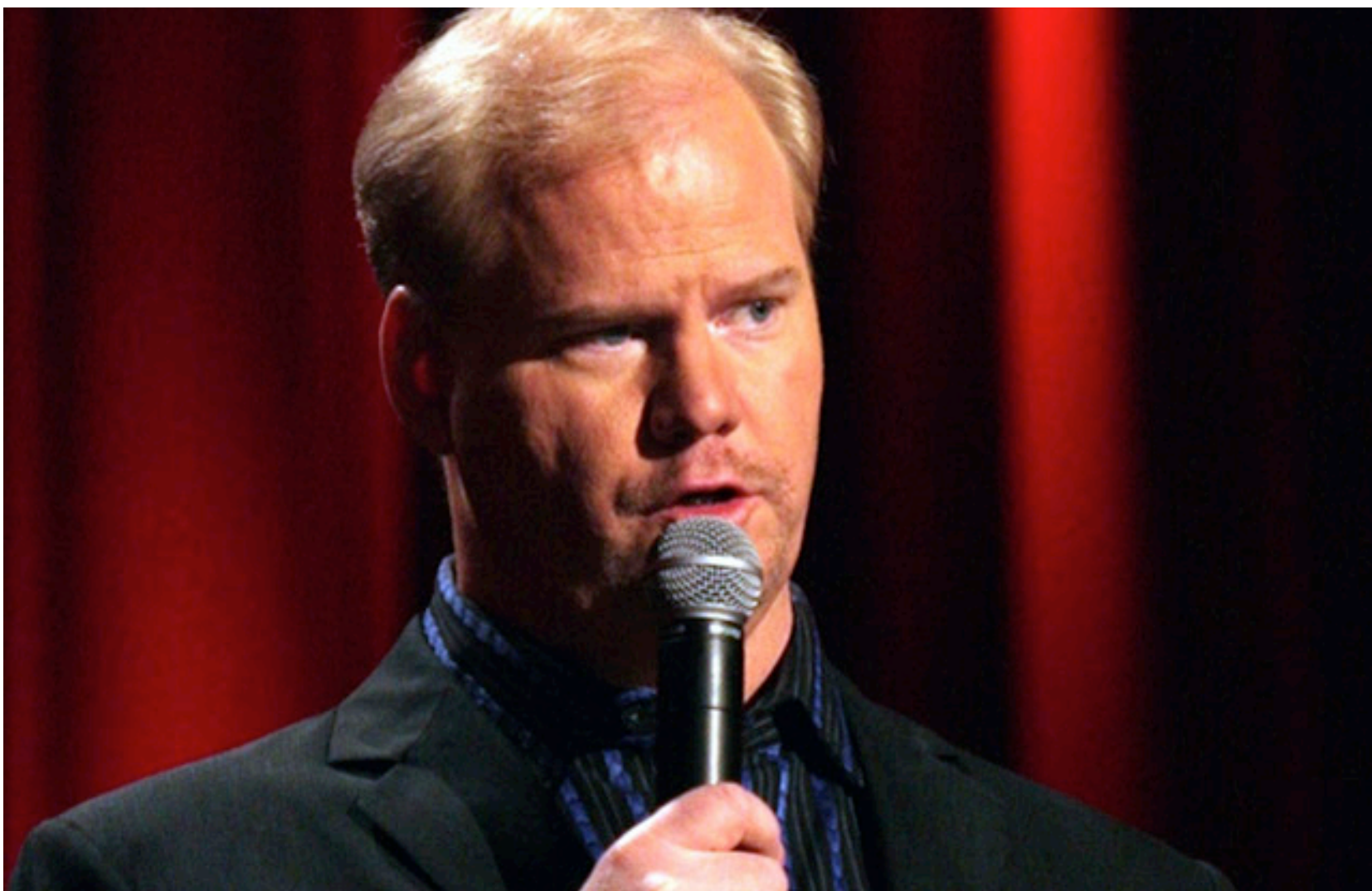
Jim Gaffigan in Action

Jim Gaffigan is hugely popular for his riffs on the American obsession with convenience foods, and hearing his Hot Pockets routine just once will have you humming the famous jingle for days (“Hot Pockets!”). Gaffigan grew up as the youngest of six siblings in Chesterton, Indiana, but began his stand-up career in New York City. He honed his act to feature his signature bits on food, and his Comedy Central specials (“Beyond the Pale,” “King Baby”) have been major blockbusters. He also has made several movies, including the recent “Away We Go” (2009), and spent three seasons on the TBS network sitcom “My Boys.” (2006-09). He also has performed on the Broadway stage, part of an ensemble cast in the 2011 version of “That Championship Season.”