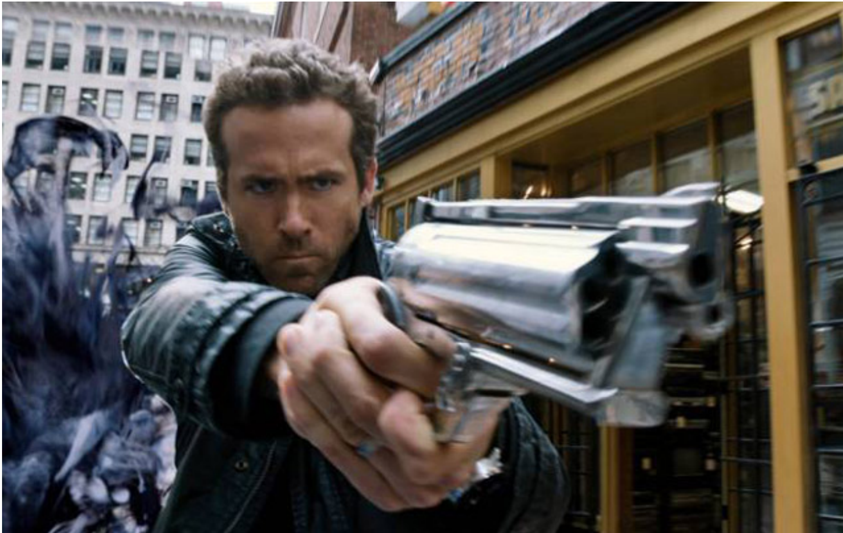
A Gun That's Happy to Be Seen: Nick (Ryan Reynolds) in 'R.I.P.D.'