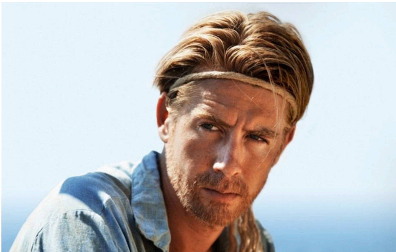
Thor Heyerdahl (Pal Sverre Hagen) in ‘Kon-Tiki’